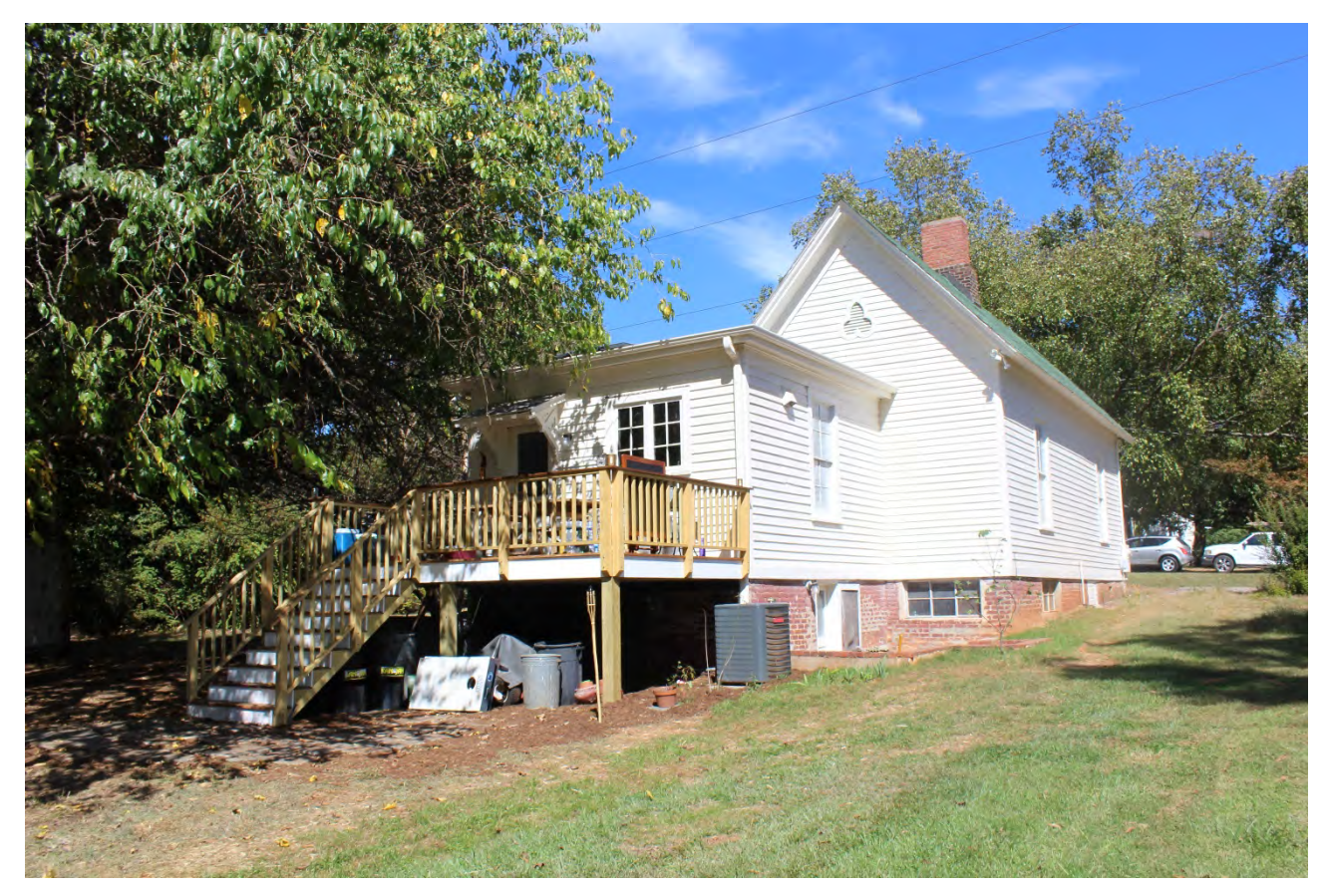
Adams-Scott House, southeast elevation