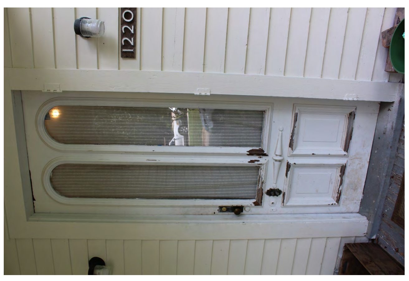
Adams-Scott House, front entrance detail