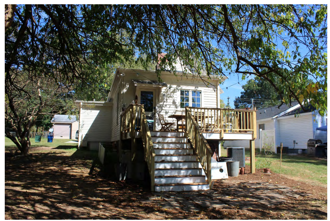
Adams-Scott House, rear elevation