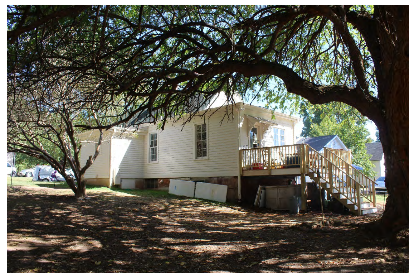
Adams-Scott House, southwest elevation