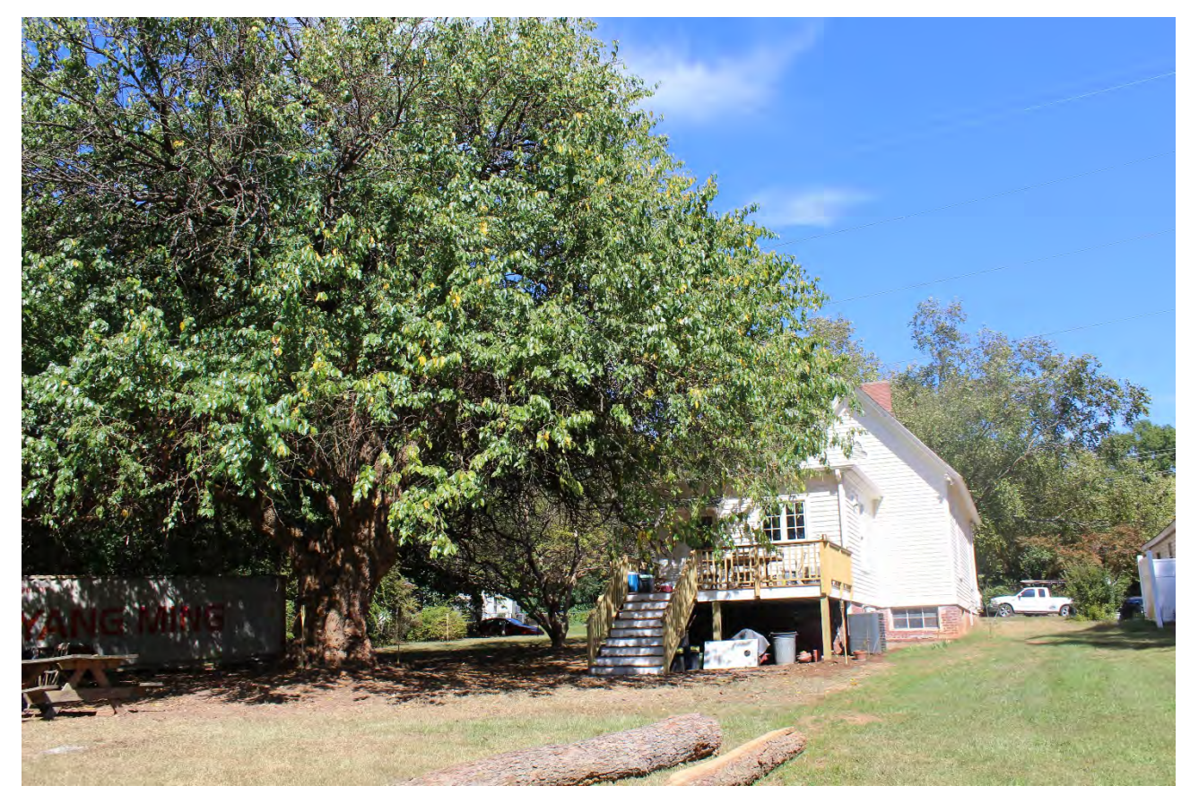
Adams-Scott House, rear elevation and yard