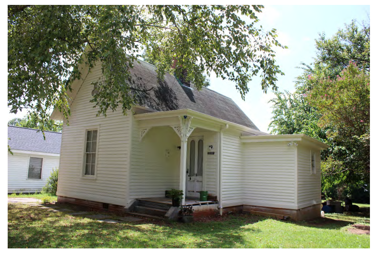
Adams-Scott House, northwest elevation