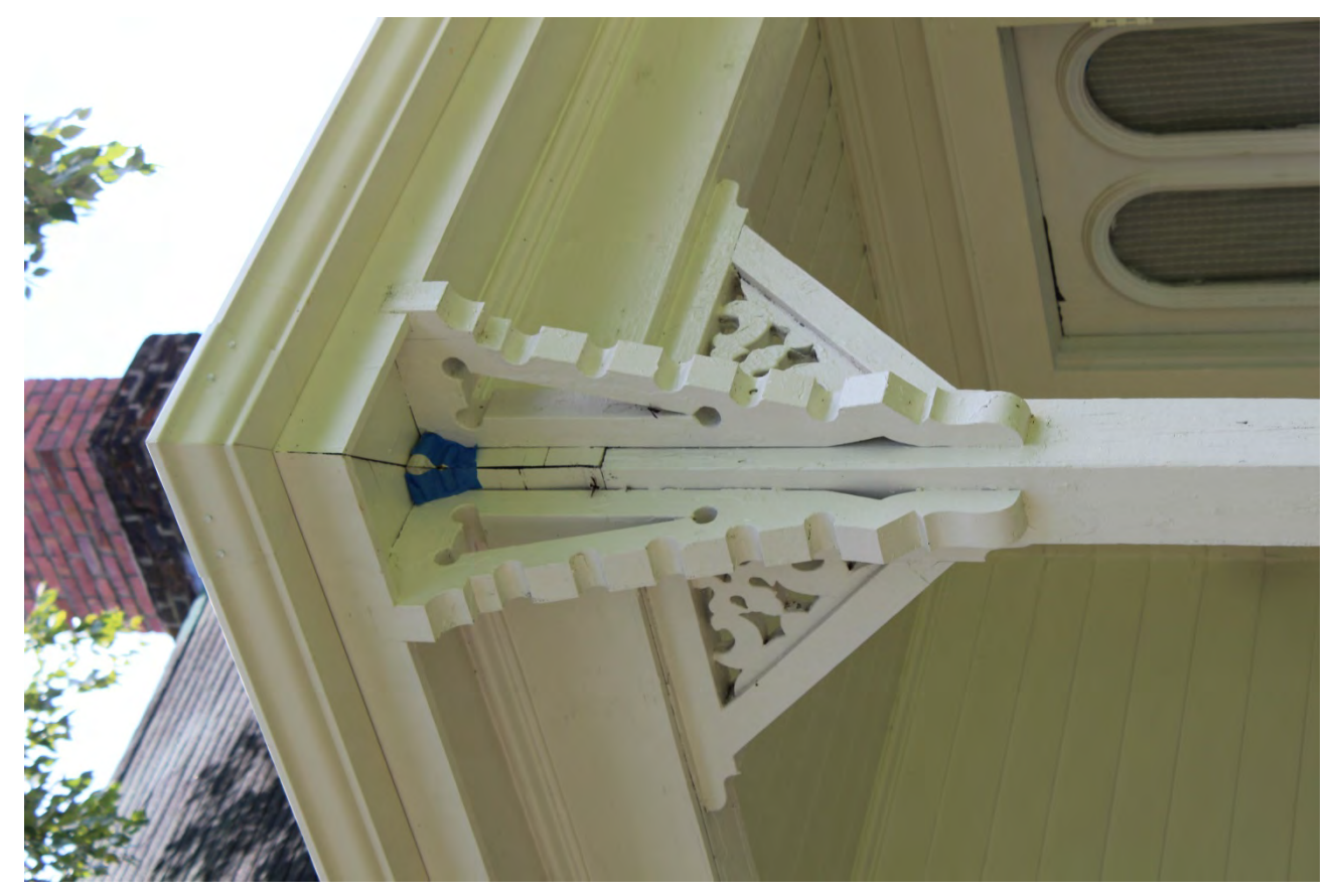
Adams-Scott House, porch detail