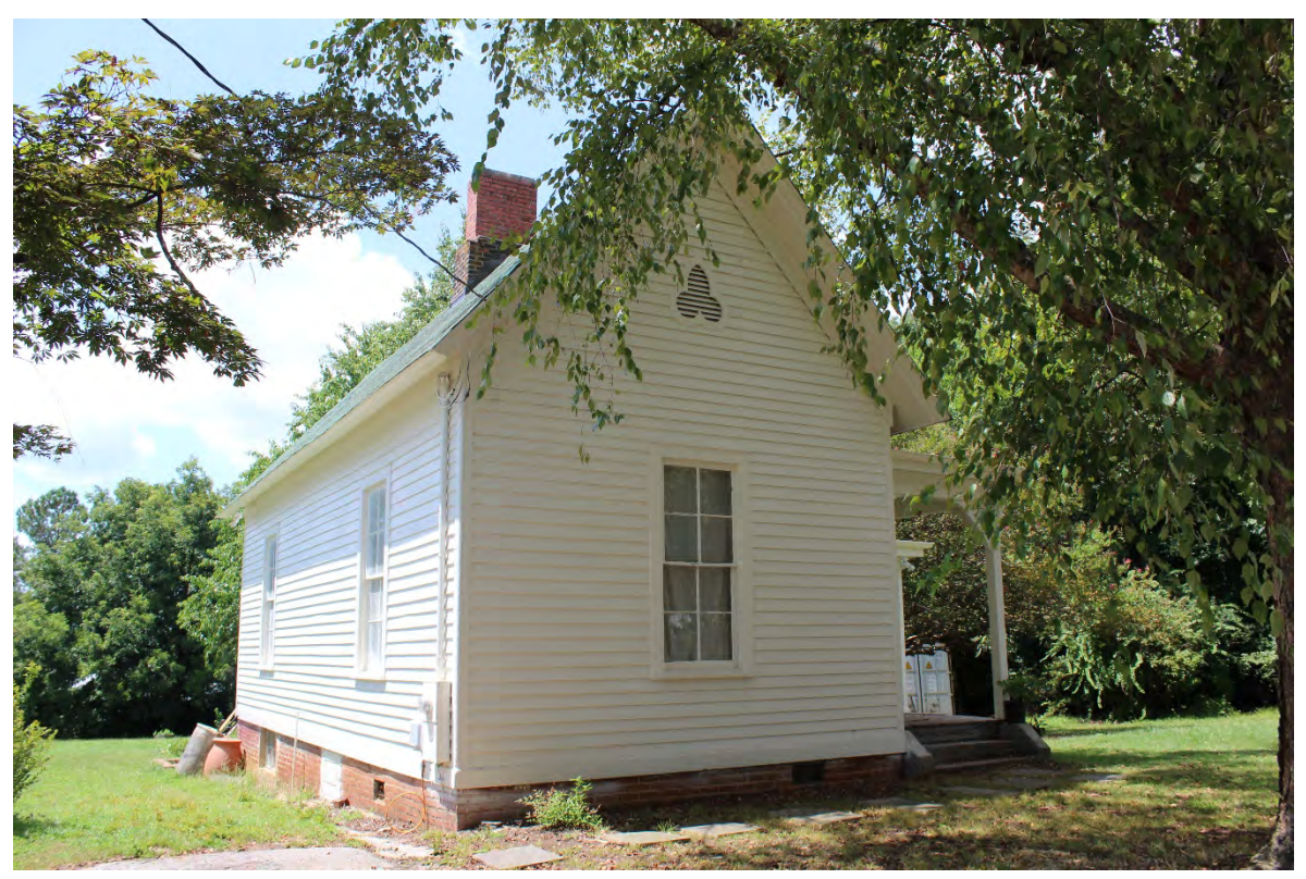
Adams-Scott House, northeast elevation