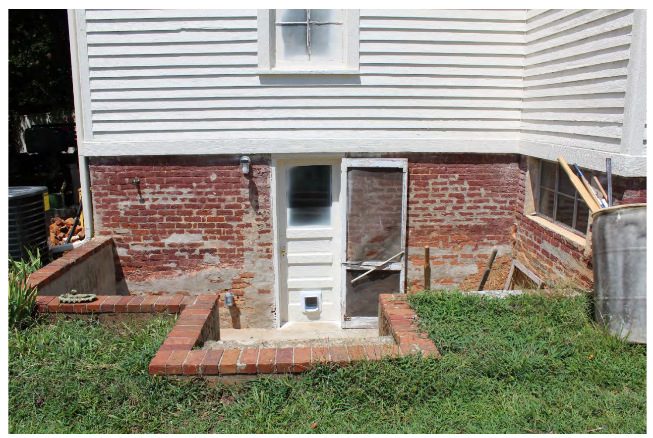
Adams-Scott House, basement entrance detail