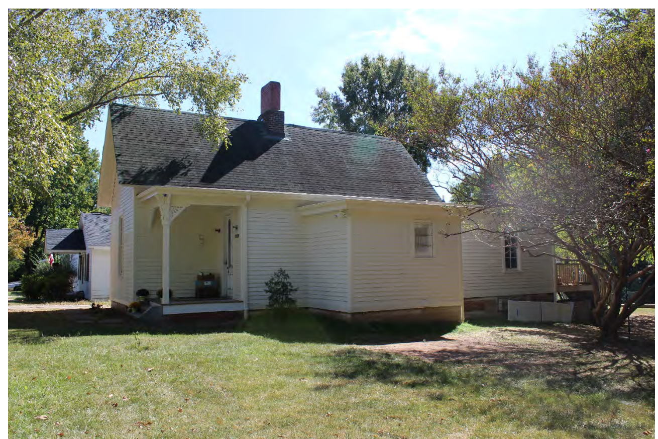
Adams-Scott House, west elevation