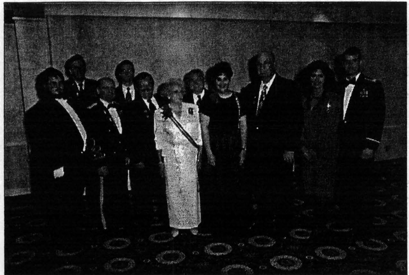
The North Carolina Division of the United Daughters of the Confederacy is based on lineal descent from veterans.

The UDC has its state headquarters and a museum in downtown Raleigh near the Executive Mansion. It is the site of frequent statewide gatherings.