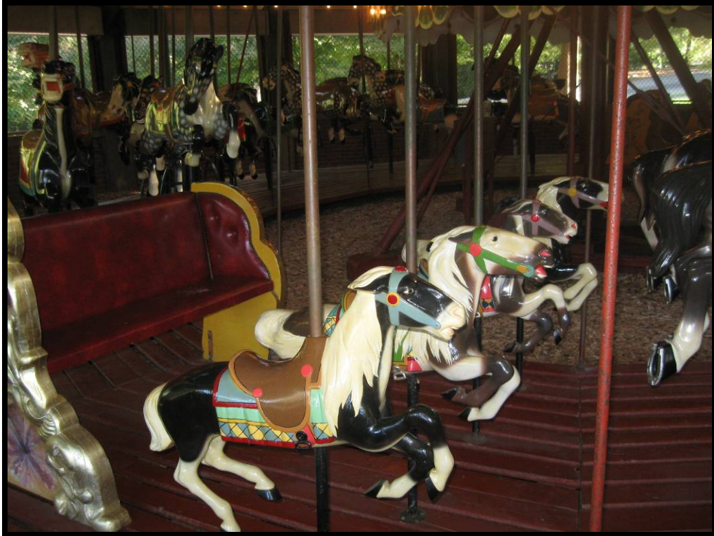
Double-seat Chariot & Tiny Cast Aluminum Horses