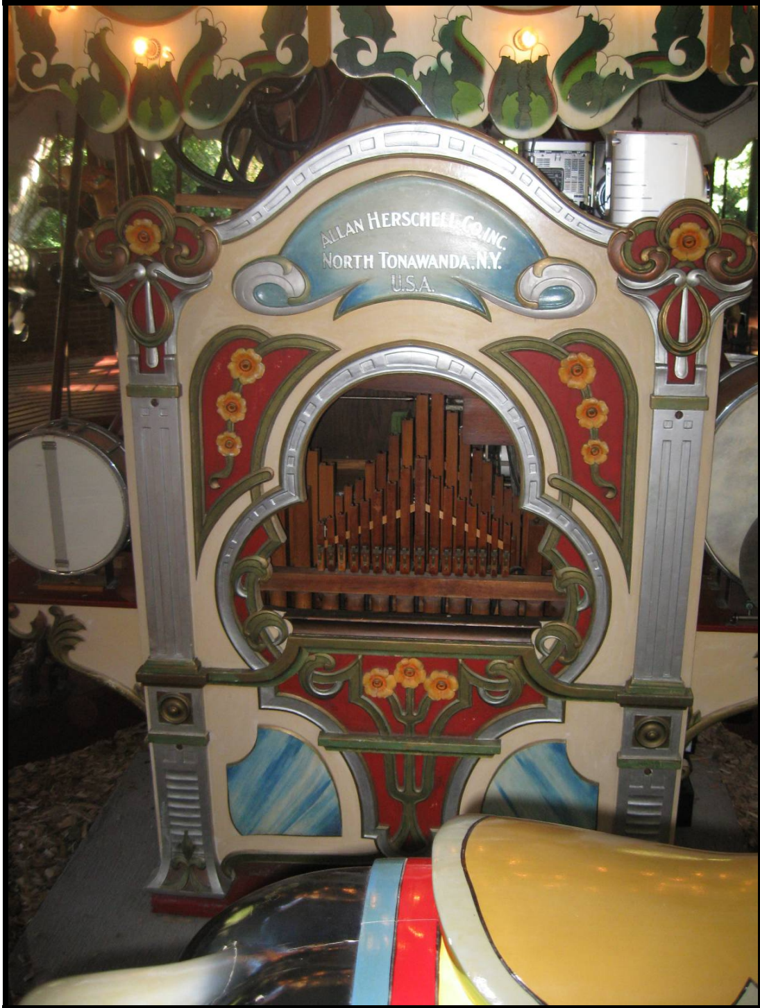
Wurlitzer Military Band Organ