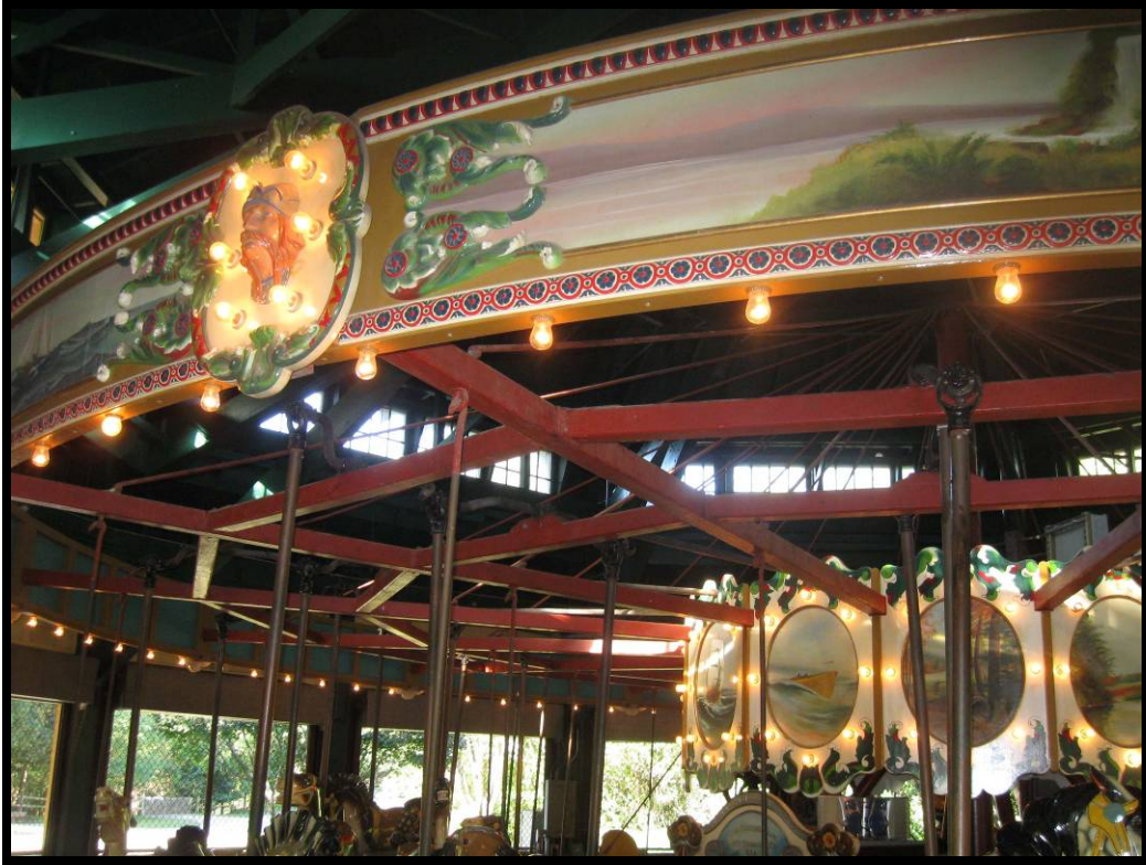
Wooden Shield with Cast Aluminum Figurehead of a Buccaneer