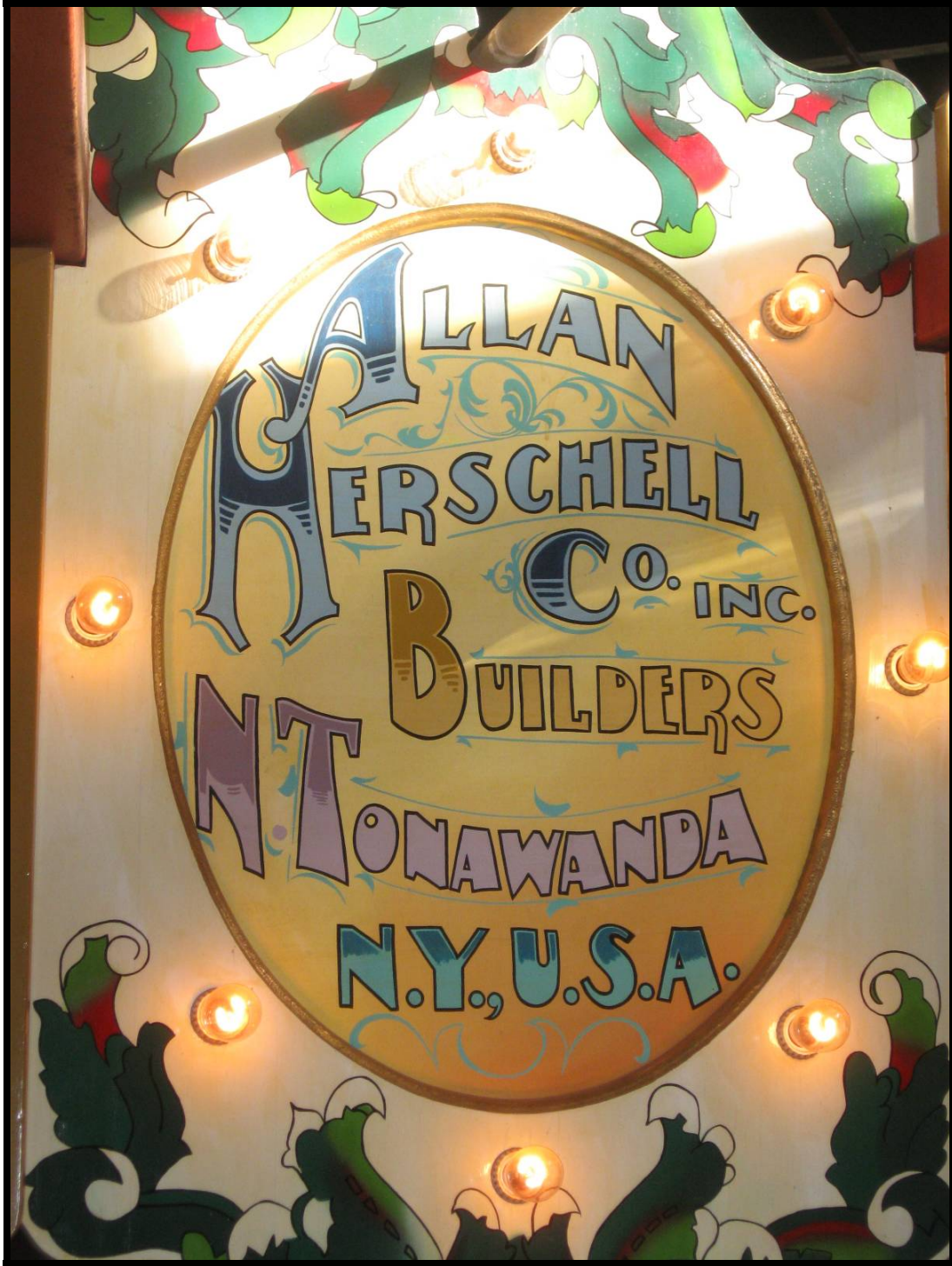
"panel Picture Center" Oval Painting