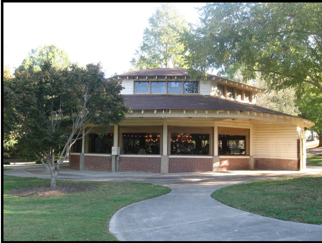
Carousel Pavilion (not designated)