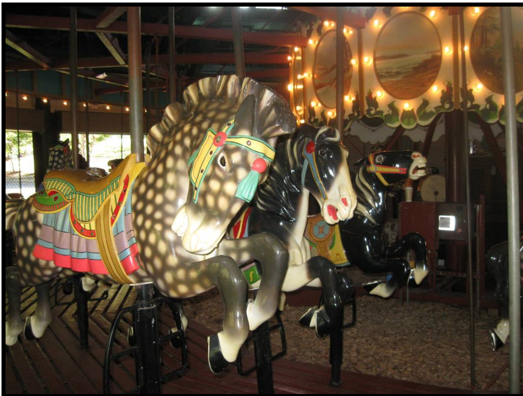
Horses Mounted With Iron Pipe Through Center & Oval Vignettes