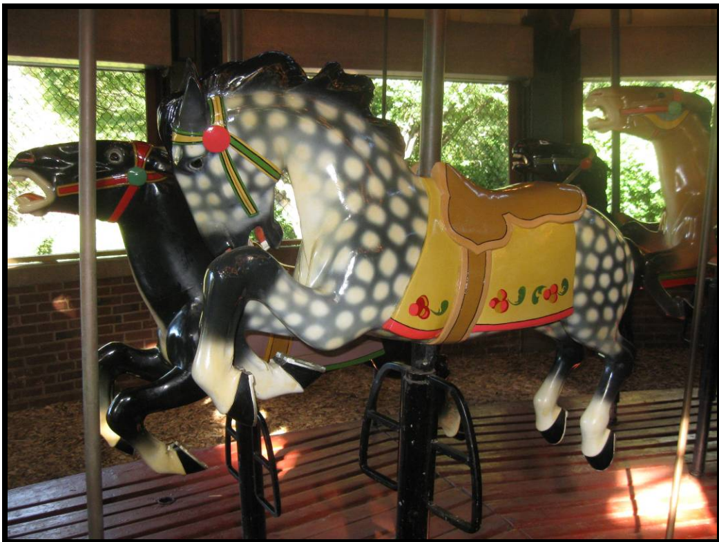
Dapple Gray Hand-Carved Horse with Blanket, Saddle, and Bridle