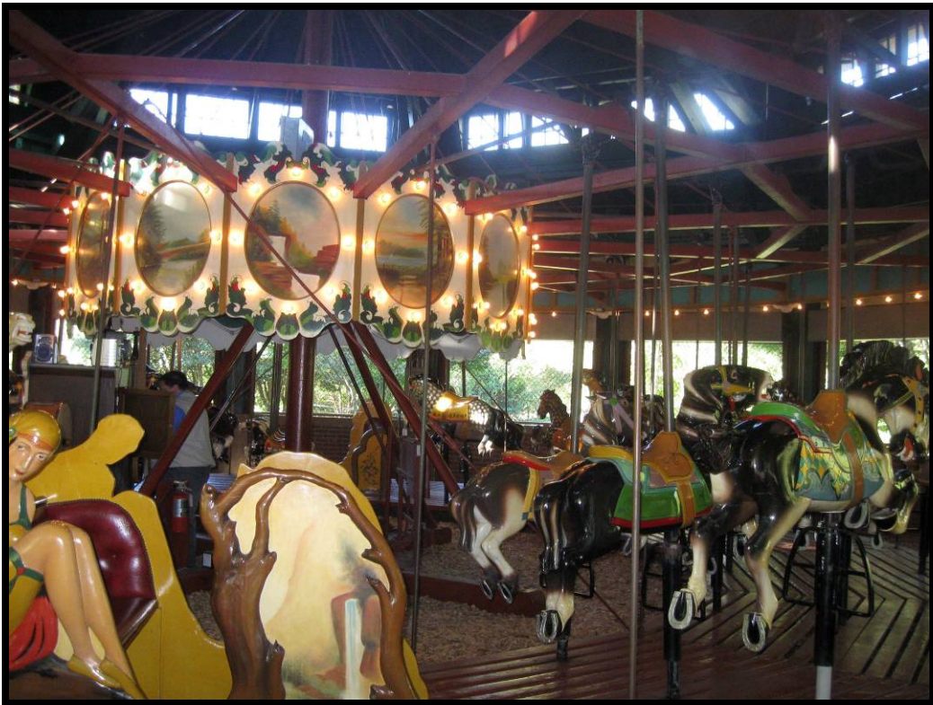
Carousel Structure with Wooden Frame, Center Iron Pole, and Plank Floor