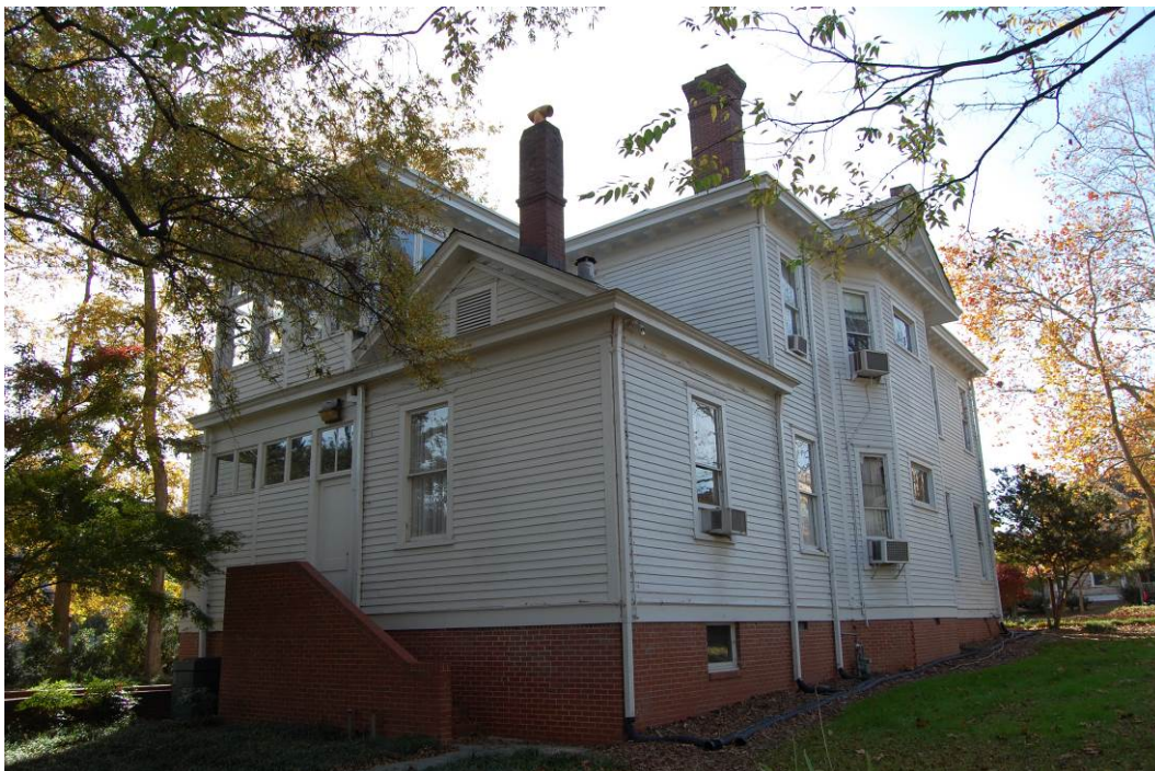
Side elevation and rear view