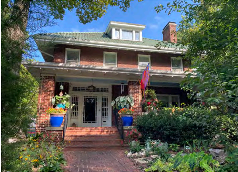
West (front) Elevation