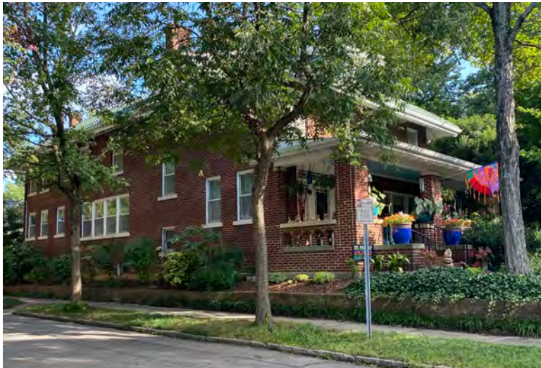
North & West Elevations