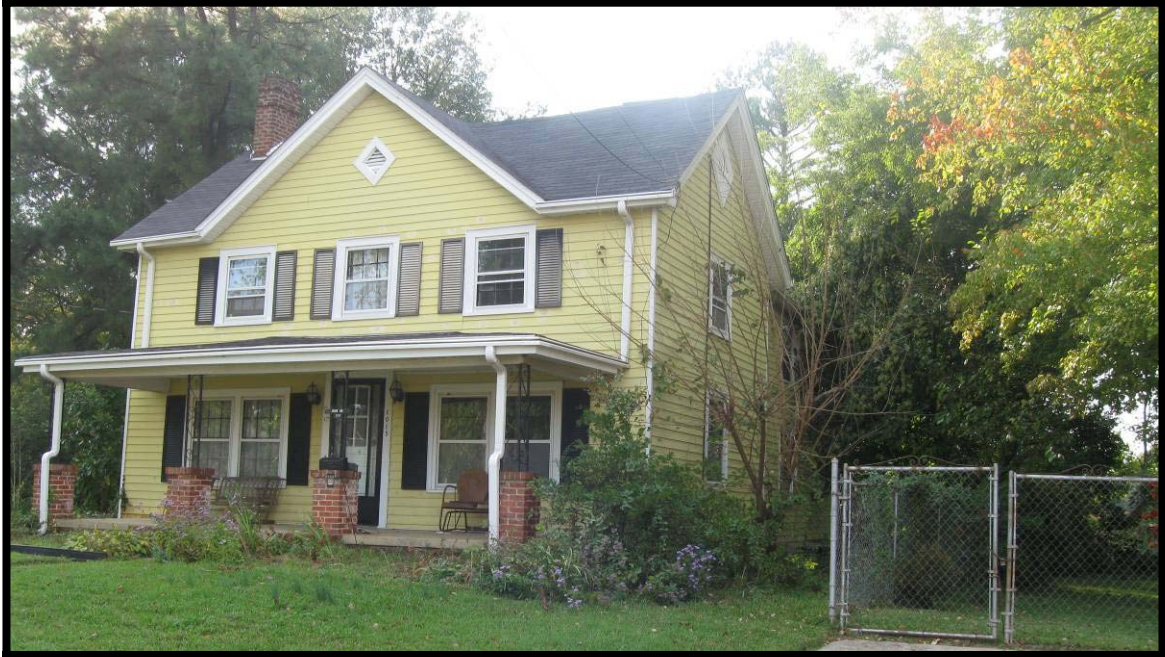
East and north façades