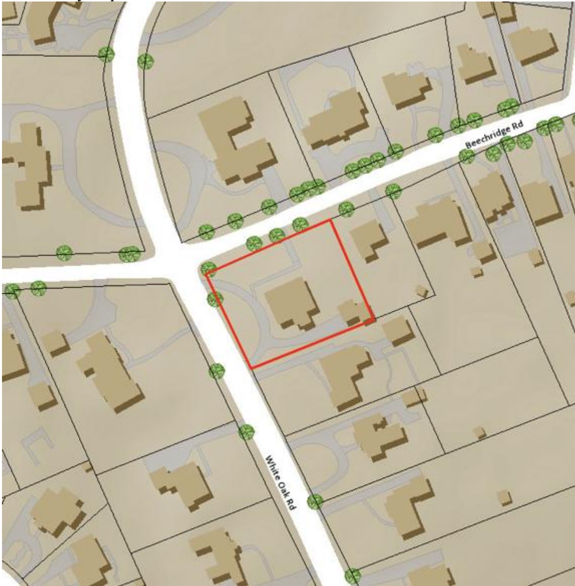
John Beaman House, 2120 White Oak Road, Raleigh, NC N↑ Tax Map courtesy of City of Raleigh and Wake County iMaps System