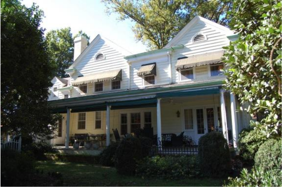
John E. Beaman House, 2120 White Oak Road, rear elevation