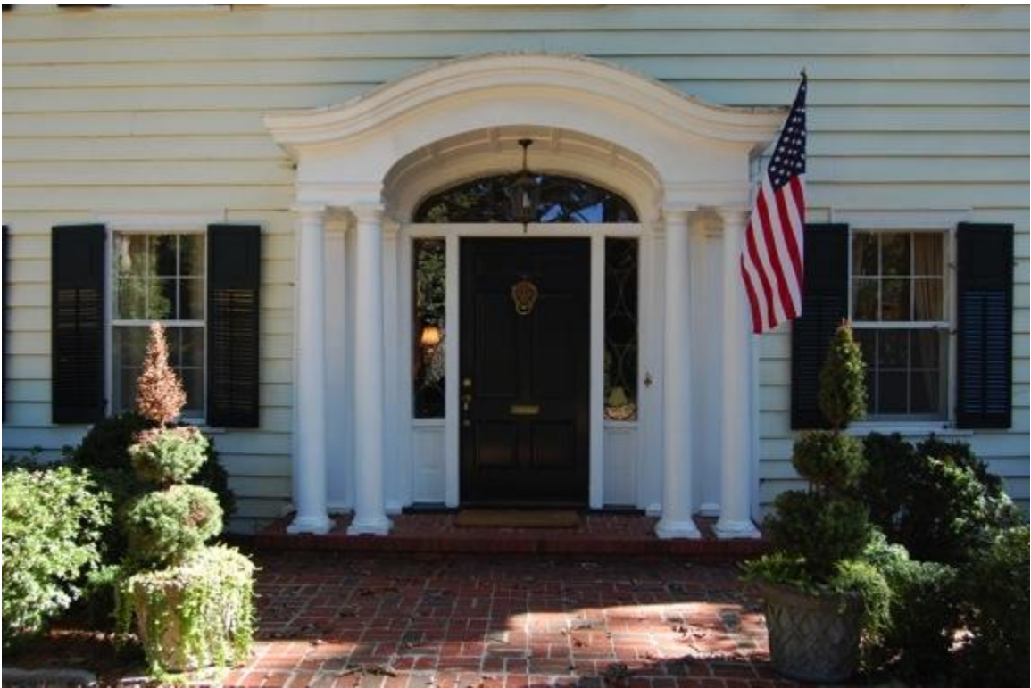
John E. Beaman House, 2120 White Oak Road, front entrance