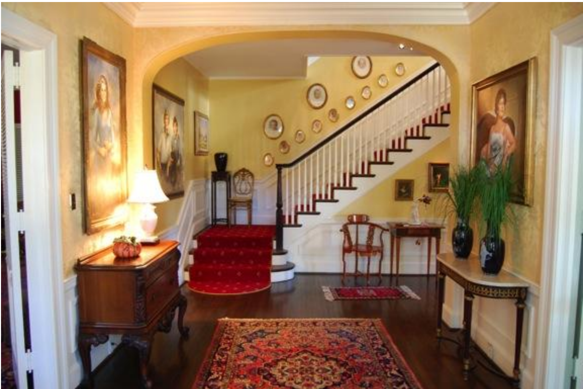
John E. Beaman House, 2120 White Oak Road, front hall interior