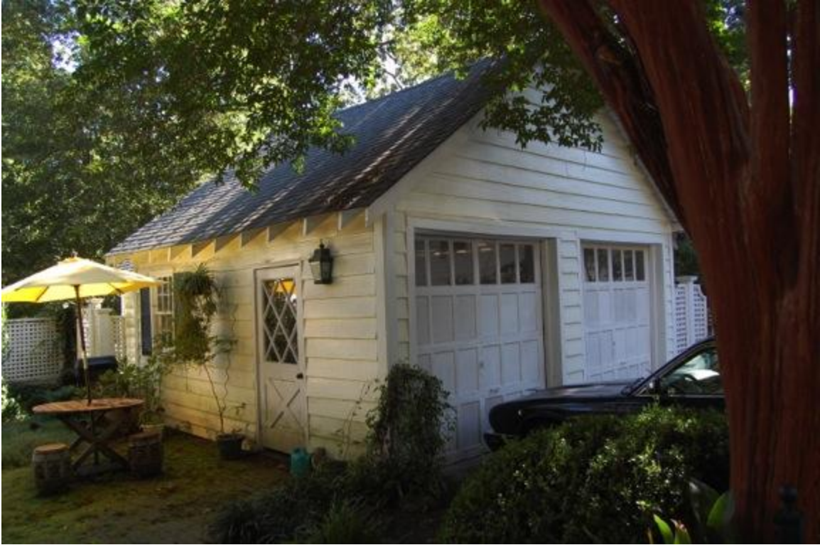
John E. Beaman House, 2120 White Oak Road, garage