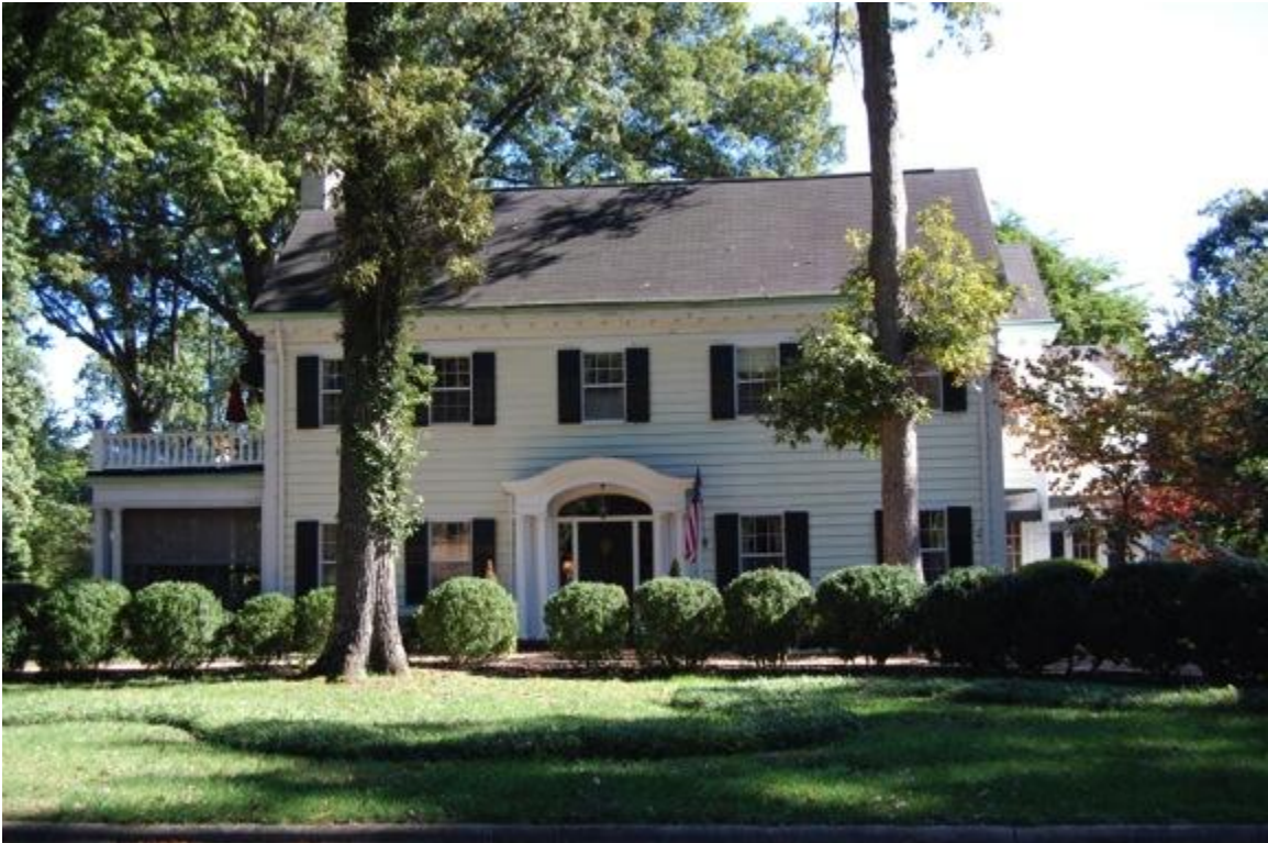
John E. Beaman House, 2120 White Oak Road, facade

A. Photographs: All photos taken October 11, 2012, by the author.