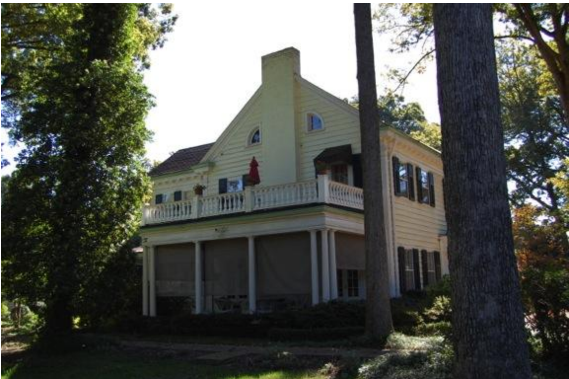
John E. Beaman House, 2120 White Oak Road, north elevation