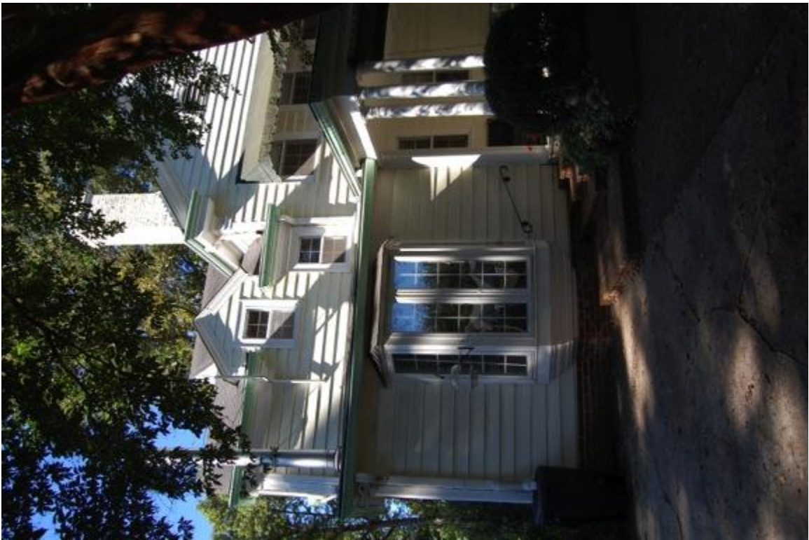
John E. Beaman House, 2120 White Oak Road, south end of rear elevation