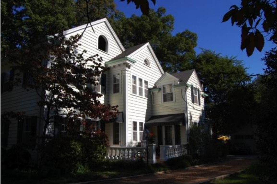
John E. Beaman House, 2120 White Oak Road, south elevation