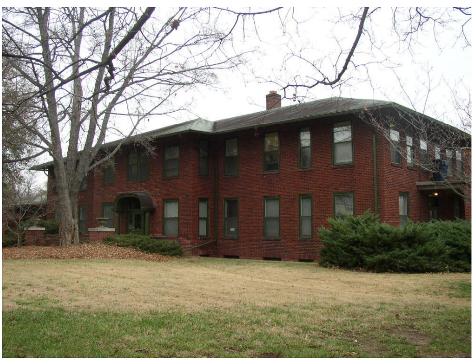
Front view from street