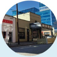
1 entertainment building