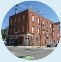
37 places associated with Black builders and architects