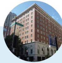
12 places associated with the Civil Rights Movement