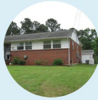
349 Biltmore Hills houses