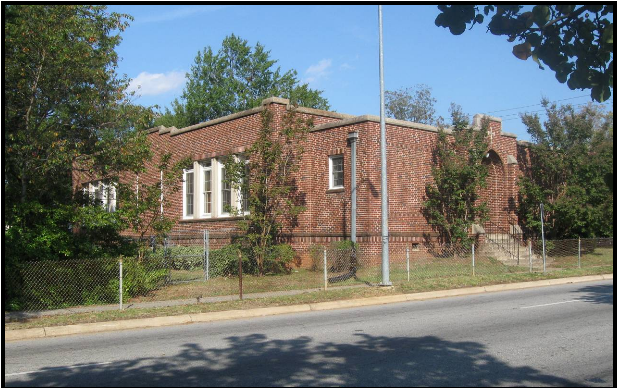
West and South facade