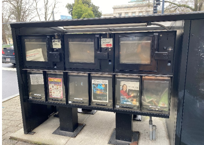
Newsrack "before" (January 2021)