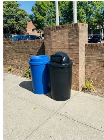
Dual Trash and Recycling Receptacles

Staff with Raleigh Arts and the Transportation department are working with a vendor to create and install vinyl art wraps by seven different artists. Each dual station will have one receptacle wrapped in art and one wrapped with a message encouraging the public to put waste and recyclables in the right place rather than littering. Wrap installation is anticipated to be complete within the next 6 weeks.