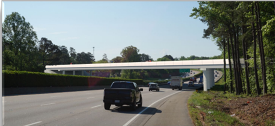
1-440 Bridge Rendering

In December 2022, Council unanimously adopted the Walkable Midtown Plan . As part of the adopted plan, the proposed Midtown Bridge is one of the “Seven Big Moves” envisioned by the plan to connect residents and visitors across the I-440 beltline. The Midtown Area Specific Guidance in the 2030 Comprehensive Plan called for additional study on potential alignments of the multimodal bridge.