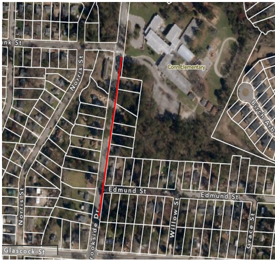
Original Conn Elementary Queuing