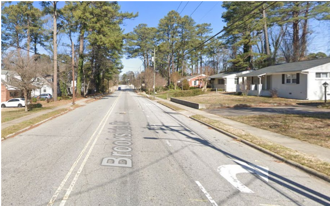
Existing Brookside Drive

Partial removal of the right turn only lane leaves approximately 700 feet of unutilized pavement on this section of Brookside. Feedback from adjacent neighbors also expressed concerns about the availability of on-street parking.