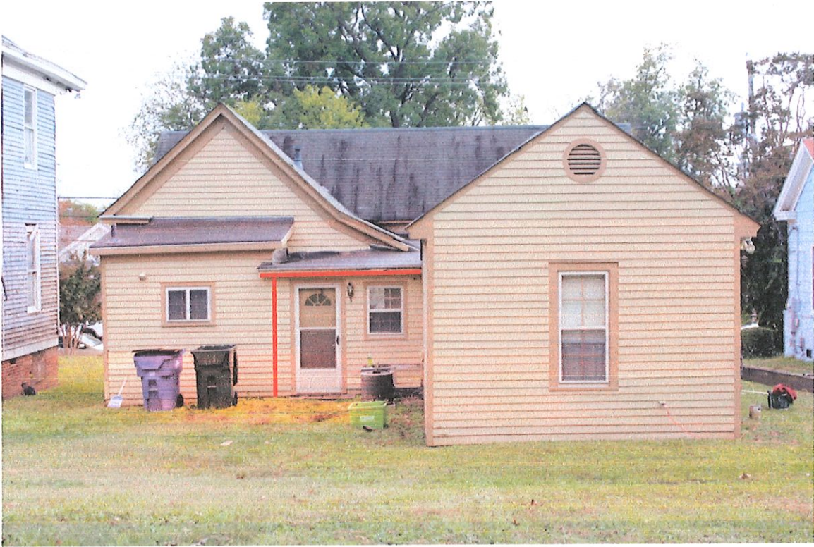
Rear (north) facade — gutter and downspout locations in red