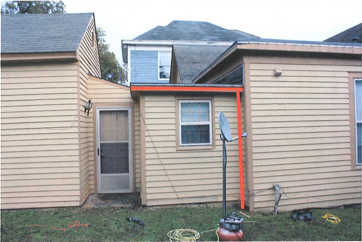
Left (west) facade — gutter and downspout locations in red