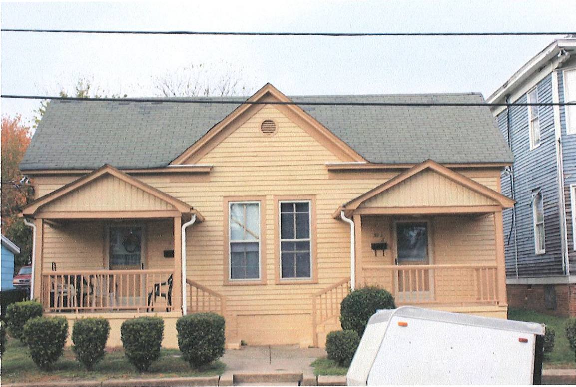
Front (south) Facade