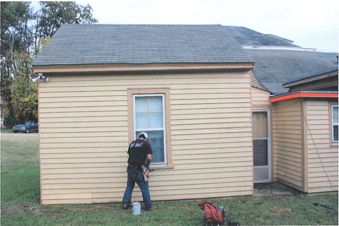
Left (west) facade — gutter and downspout locations in red