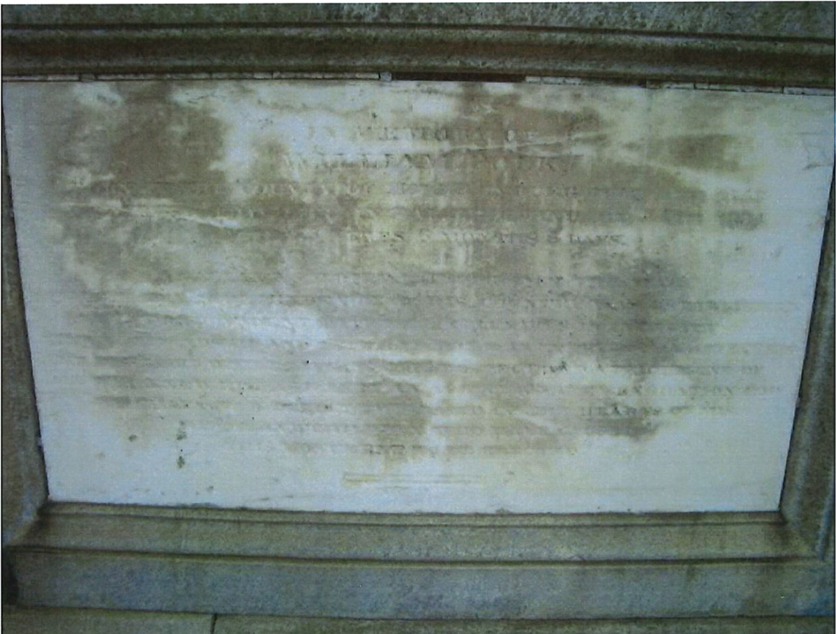
Photo 5 - Damaged monument inscription