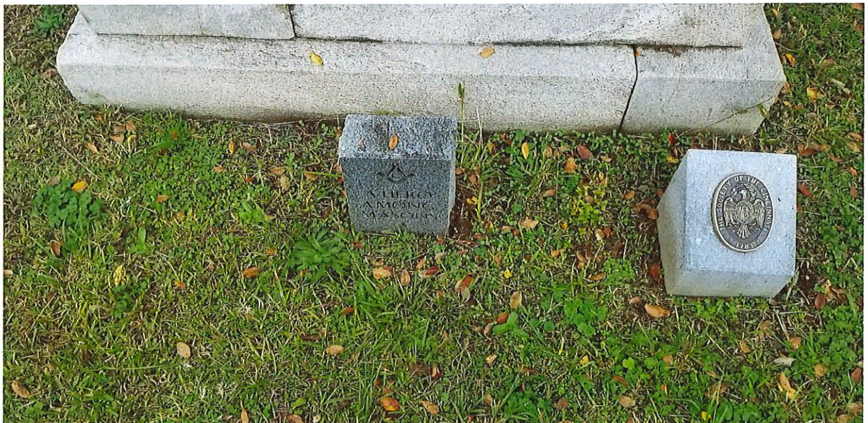
Photo 7 - Base of monument with Mason and Society markers