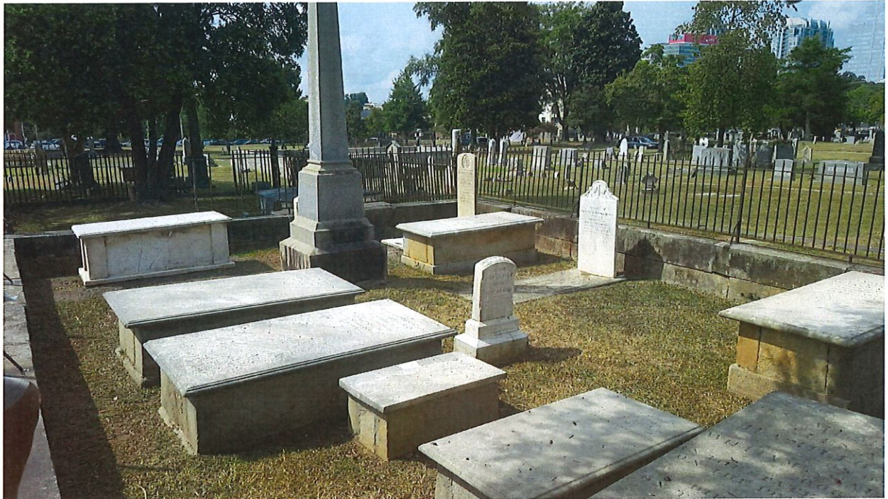
Photo 4 - After restoration