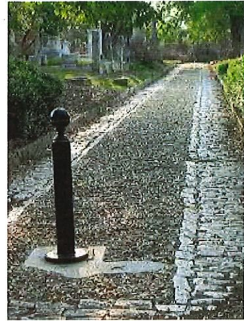
Proposed bollard Example located at City Cemetery