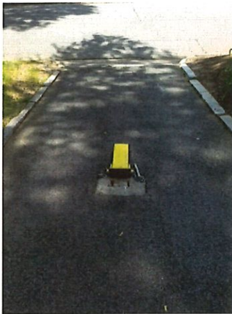
Existing bollard (broken) west entrance from Mordecai Drive