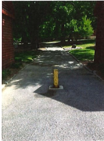
Existing bollard north entrance from Cedar Street.