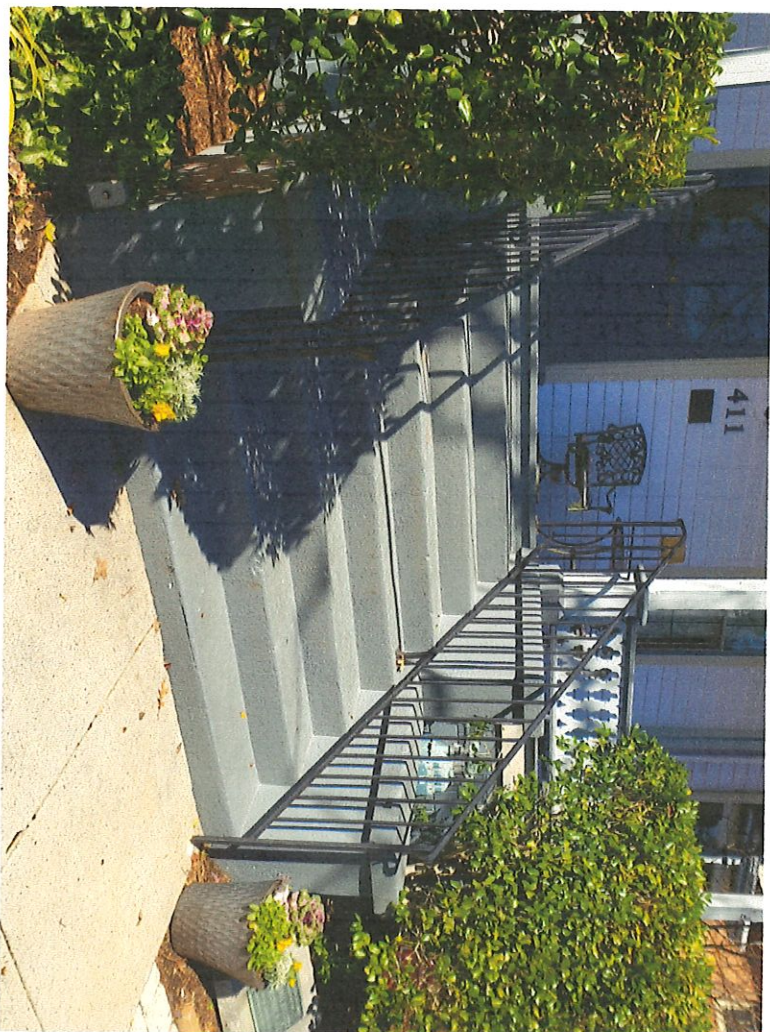
411 N. BLOODWORTH ST.