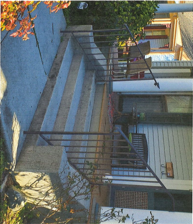
408 N. BLOODWORTH ST.