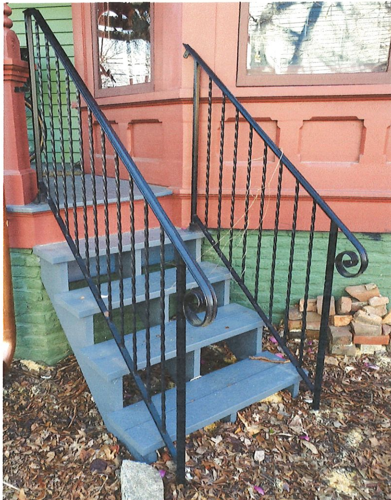
401 N. PERSON ST STEPS AT BACK OF FRONT PORCH