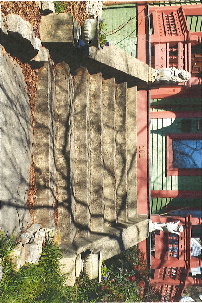
401 N. PERSON ST.