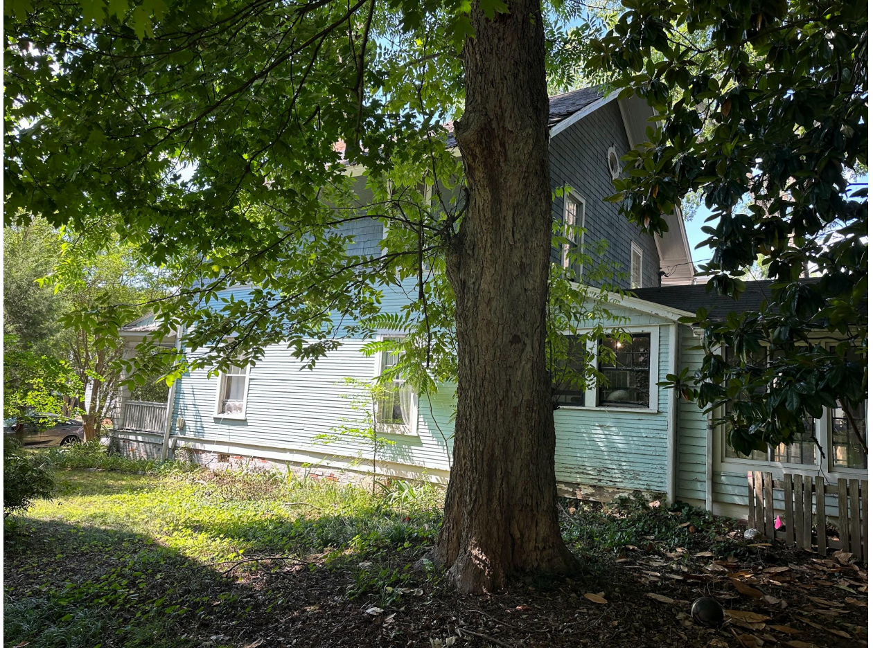
Side - South Facing