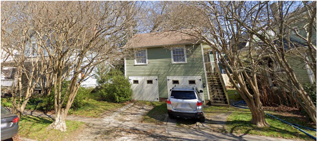
View of neighbor's detached garage adjacent to the proposed location.