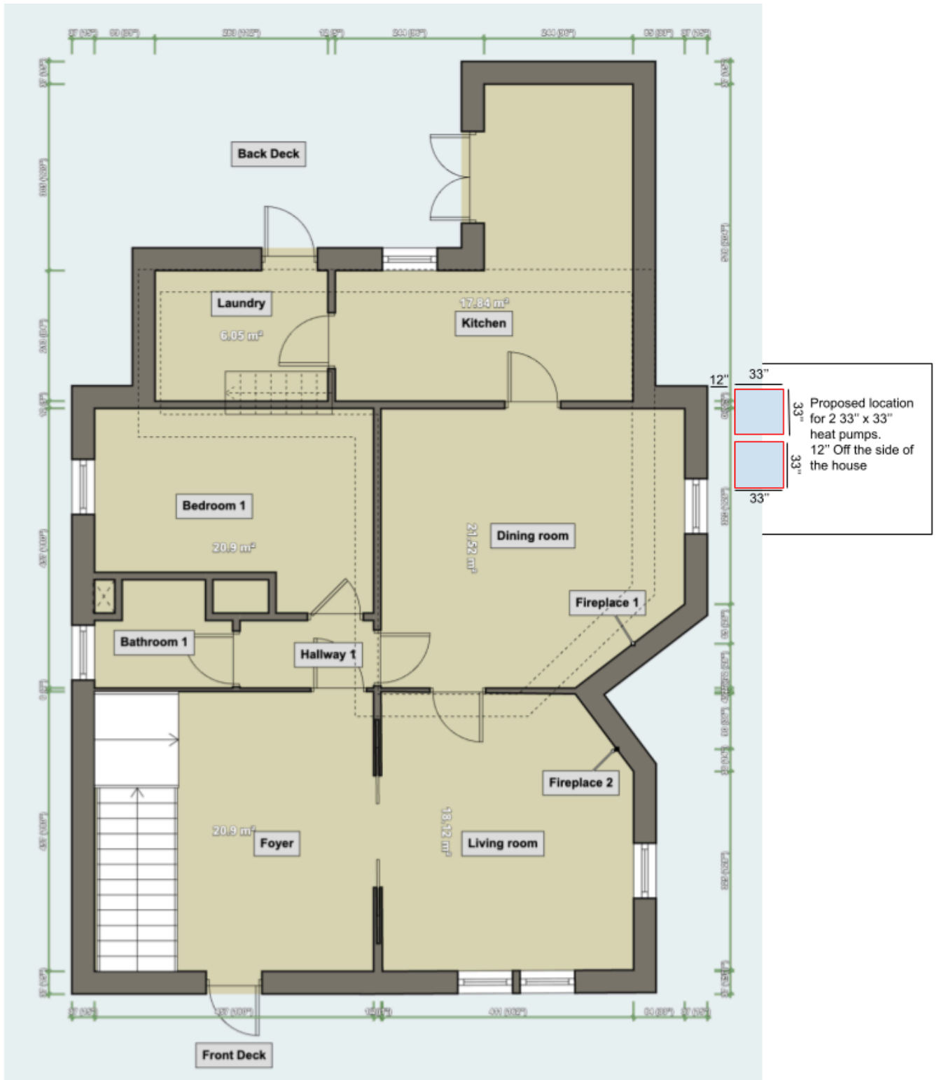
Proposed HVAC outdoor unit location