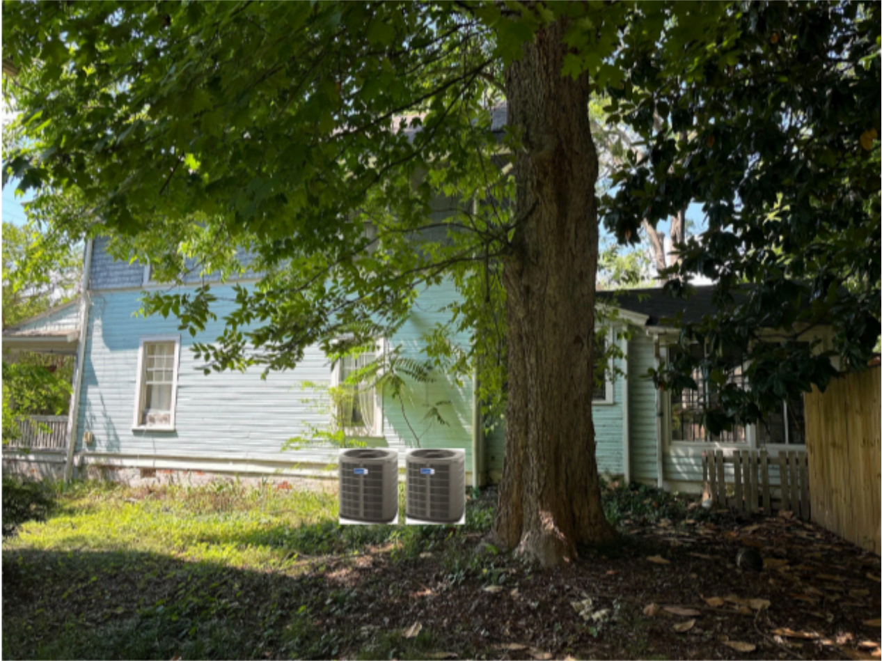
Example of where the HVAC components will be installed on the house