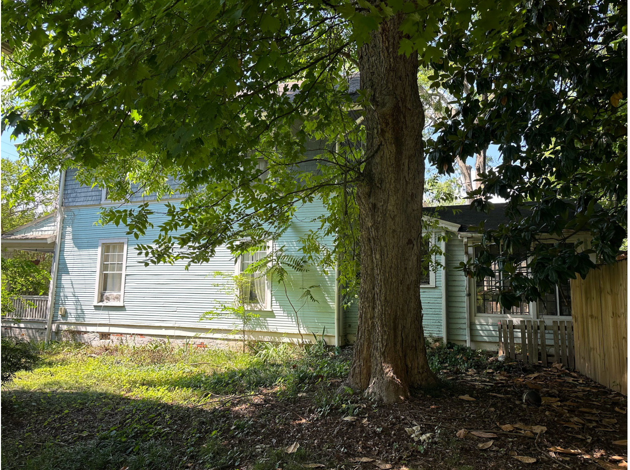
Side - South Facing