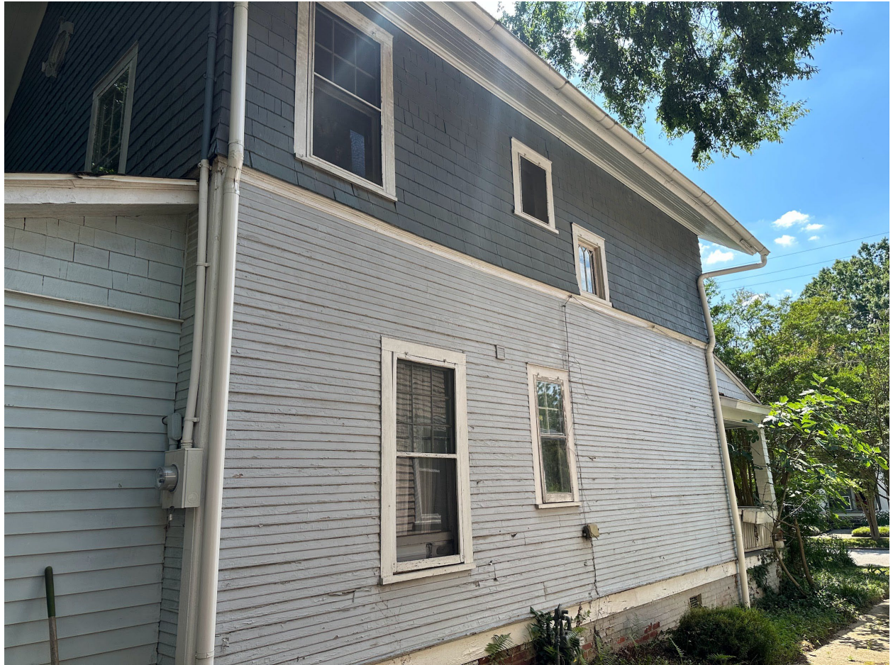
Side - North Facing