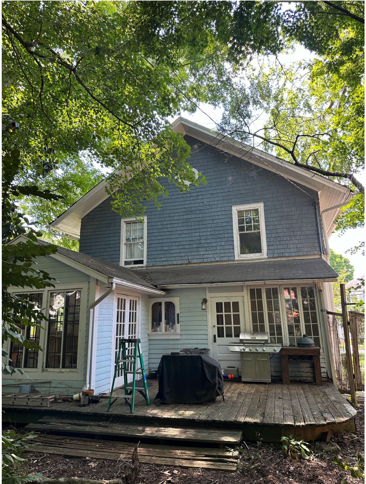
Rear - East Facing Floorplan - downstairs