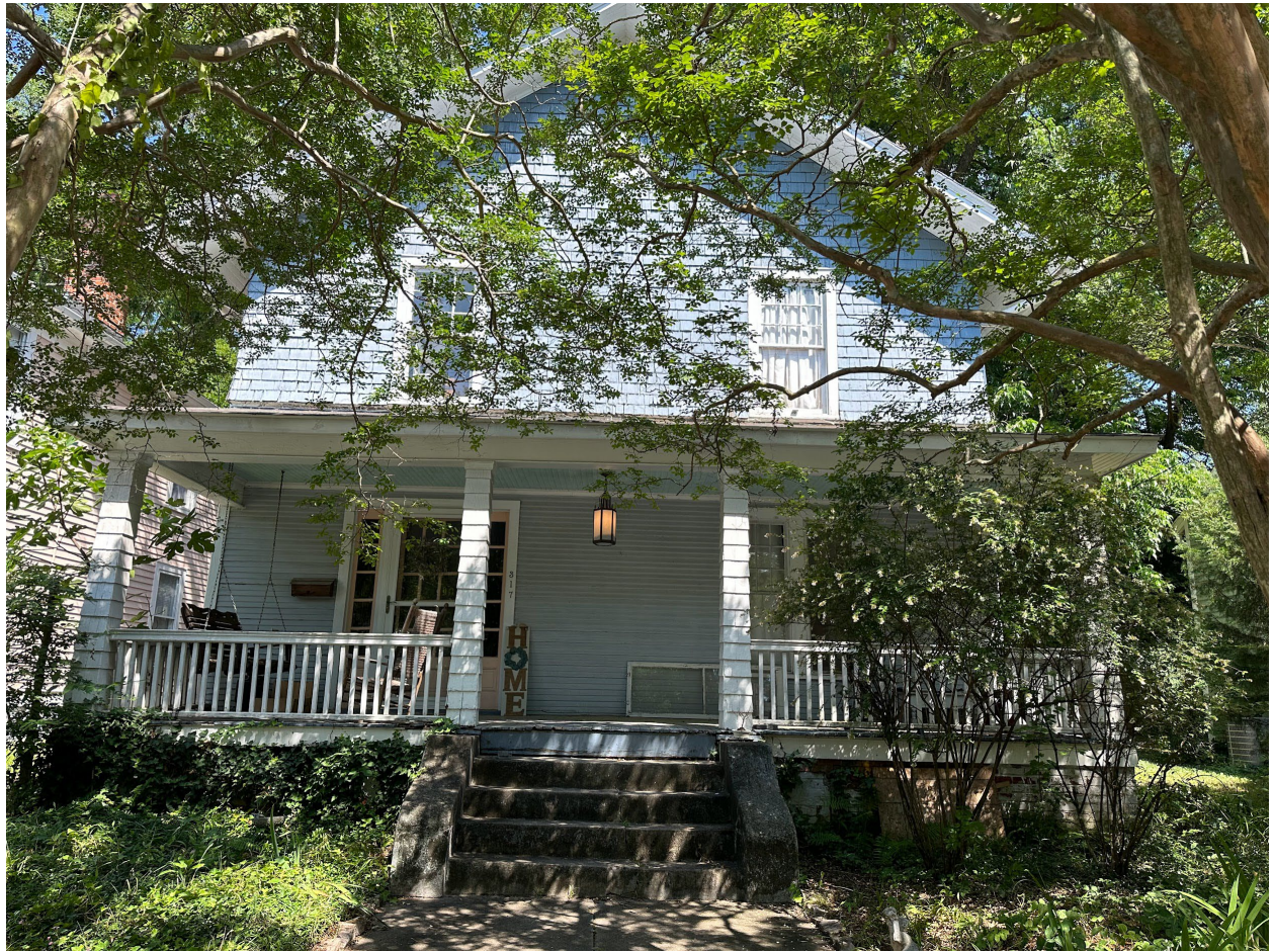
Front - West Facing