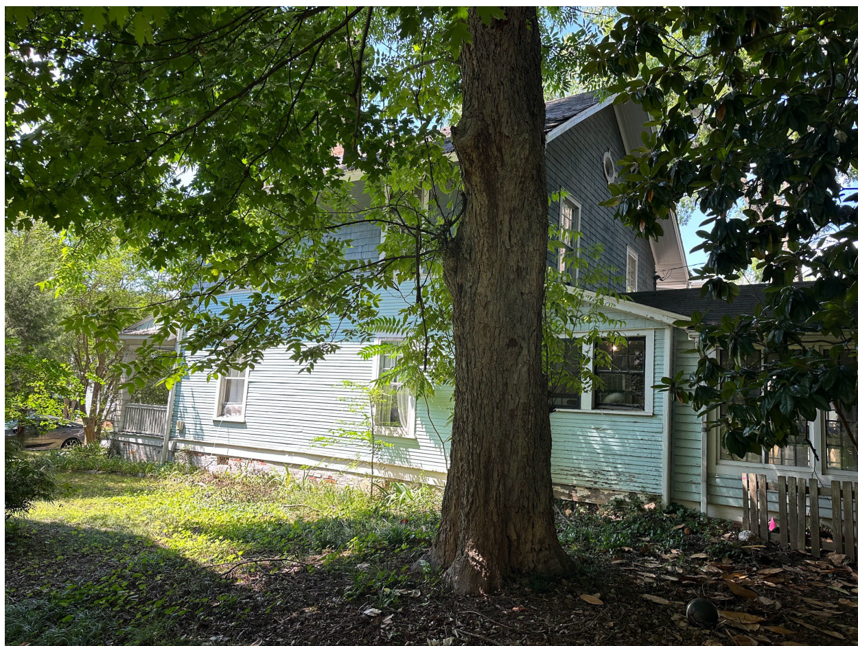
Side - South Facing