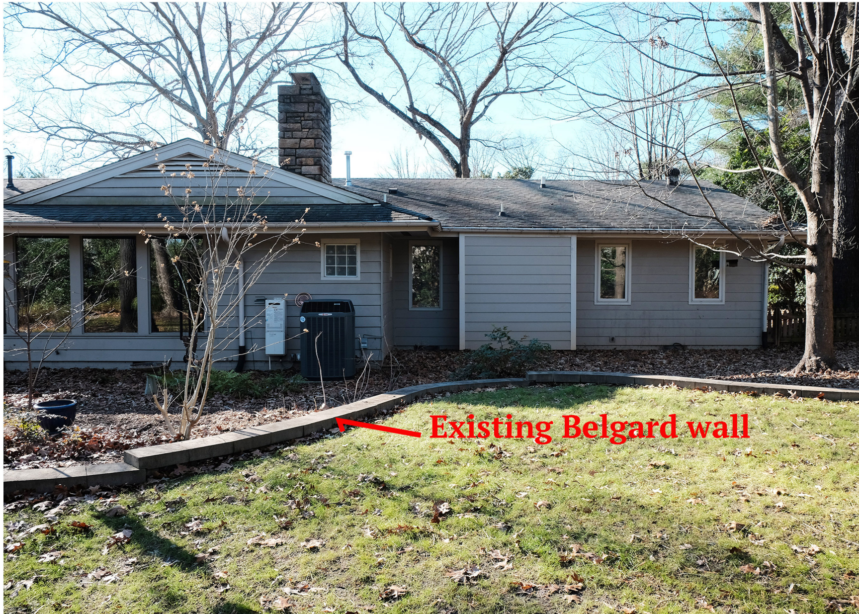
NO.5 MCADAMS HOUSE, 2214 WHEELER RD., RALEIGH 12-26-18 EAST VIEW (RIGHT)