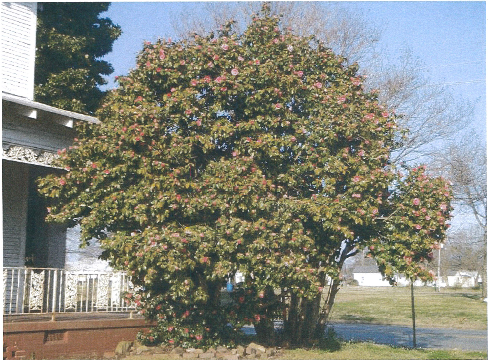
Camellia japonica - in bloom full plant