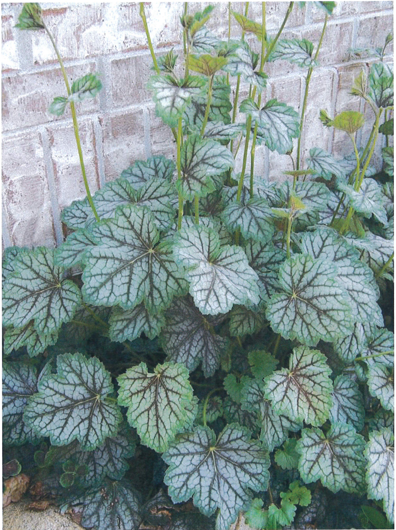
Heuchera americana leaves