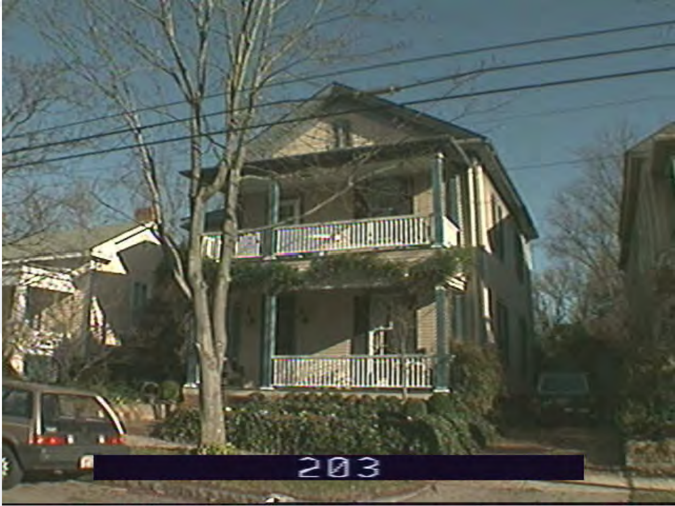
Photograph Date: 3/9/1996