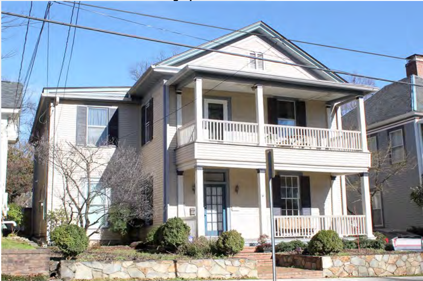
Photograph Date: 1/11/2016