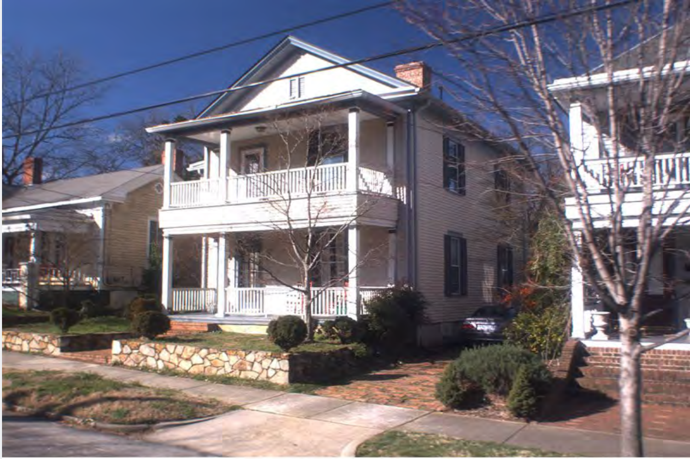
Photograph Date: 2/17/2013