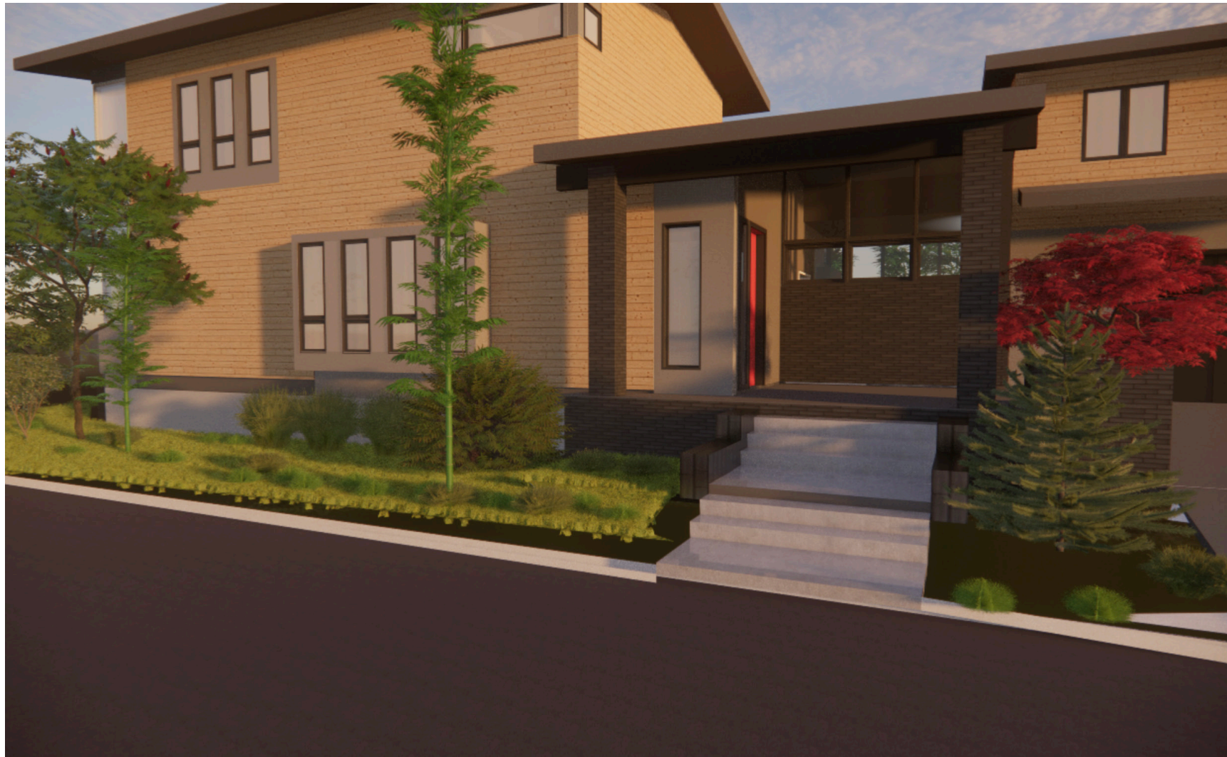
Proposed View of Front

Minor Work Application for COA 516 Euclid St, Raleigh, NC 27604