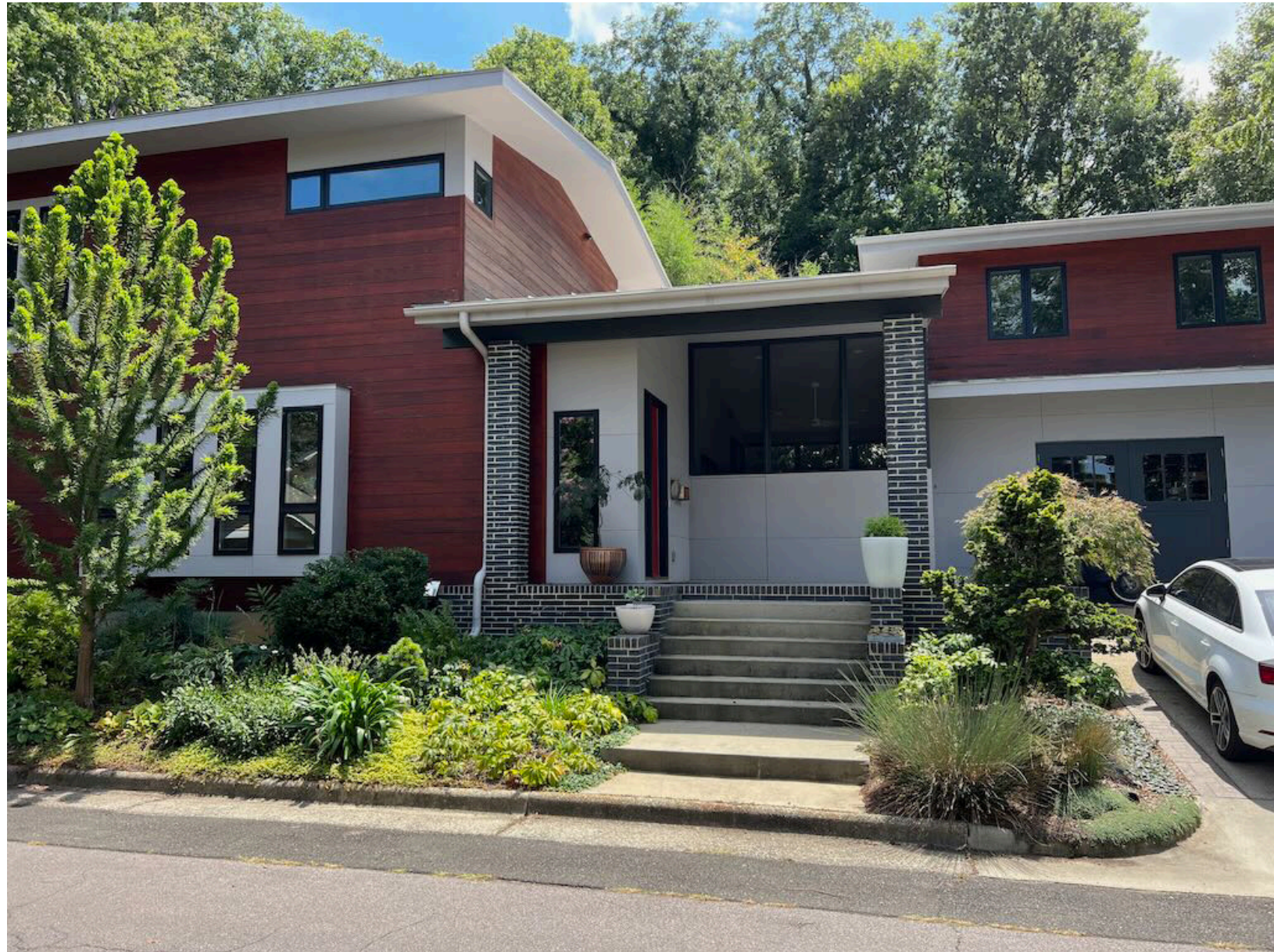
Existing View of Front