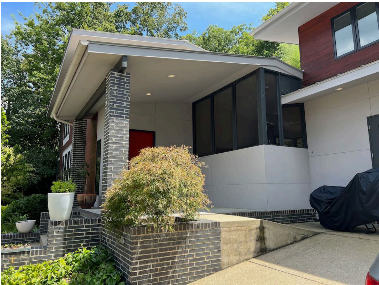
Existing View of Front/Side