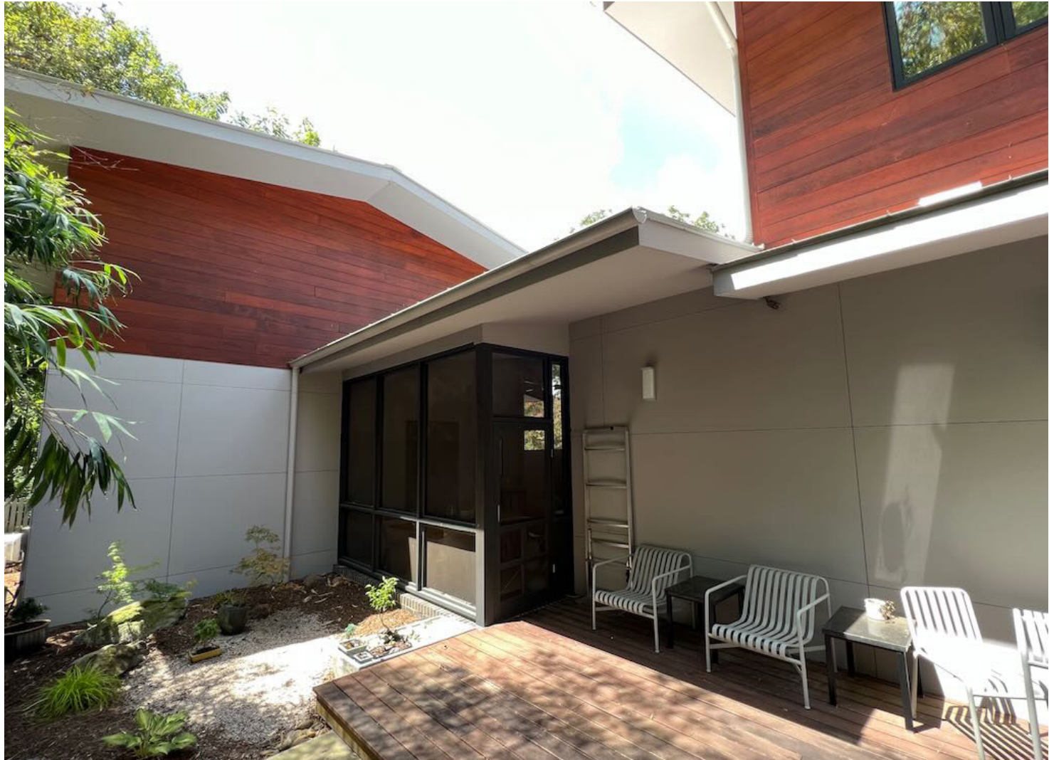
Existing View of Rear Porch