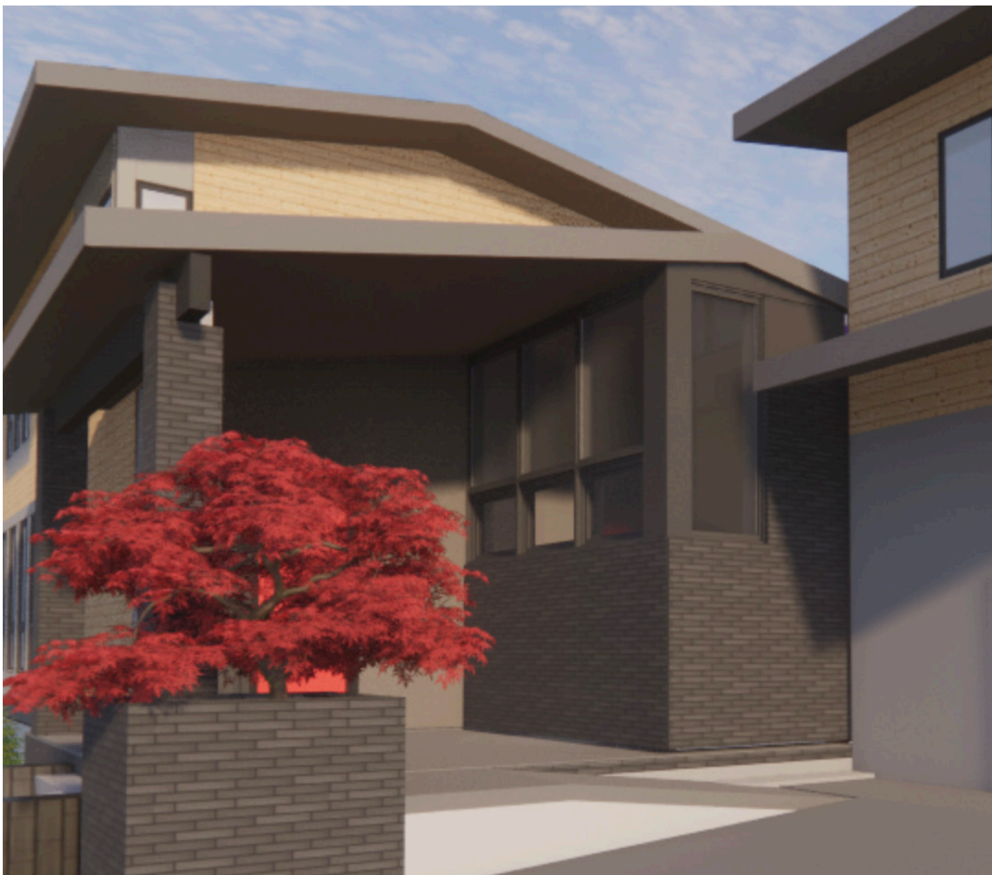
Proposed View of Front/Side

Submitted by Louis Cherry, Owner 8/16/2023