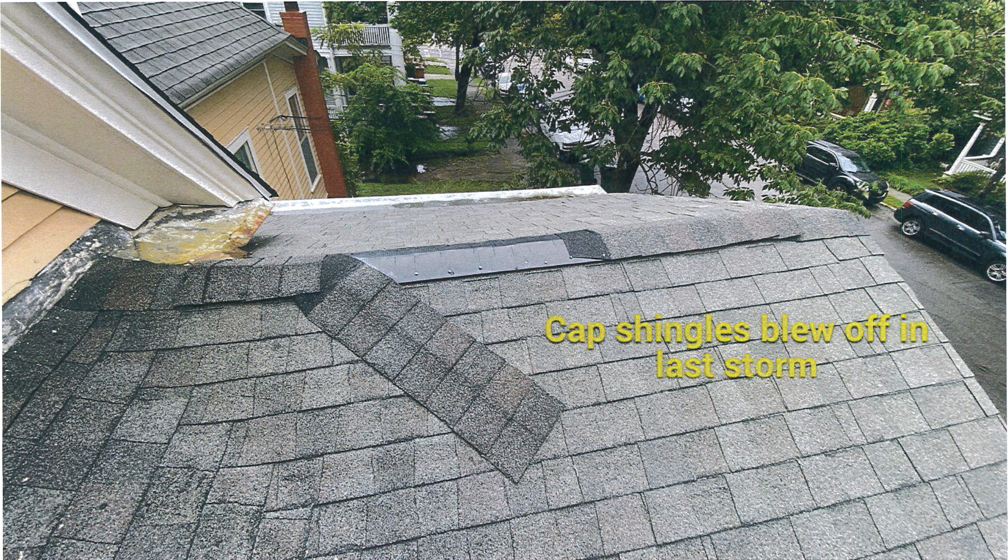
Cap shingles blew off in last storm