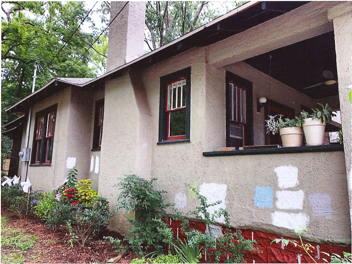
Left Side (Northwest)