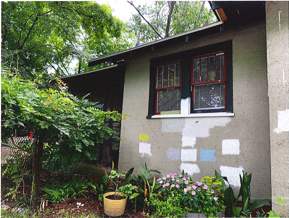
Left Side (Northwest)