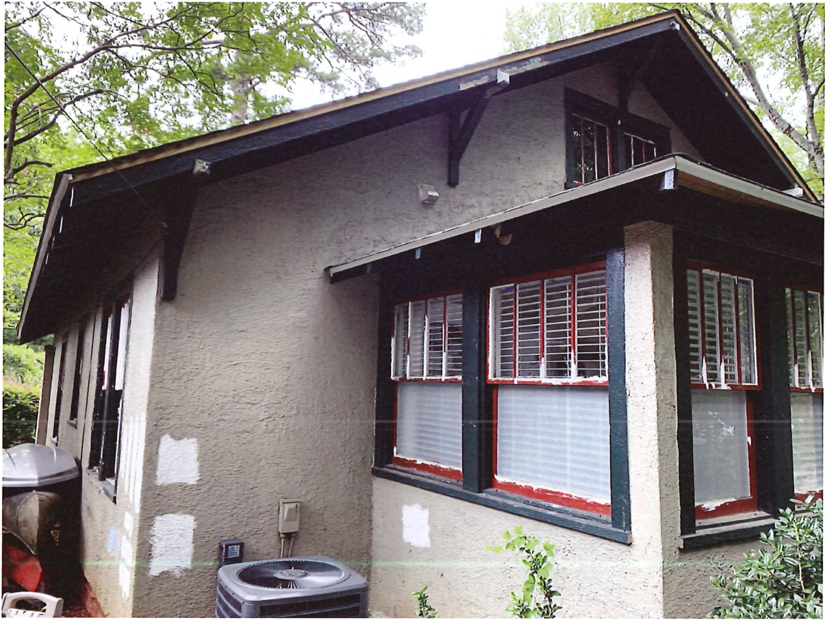
Right Side (Northeast)