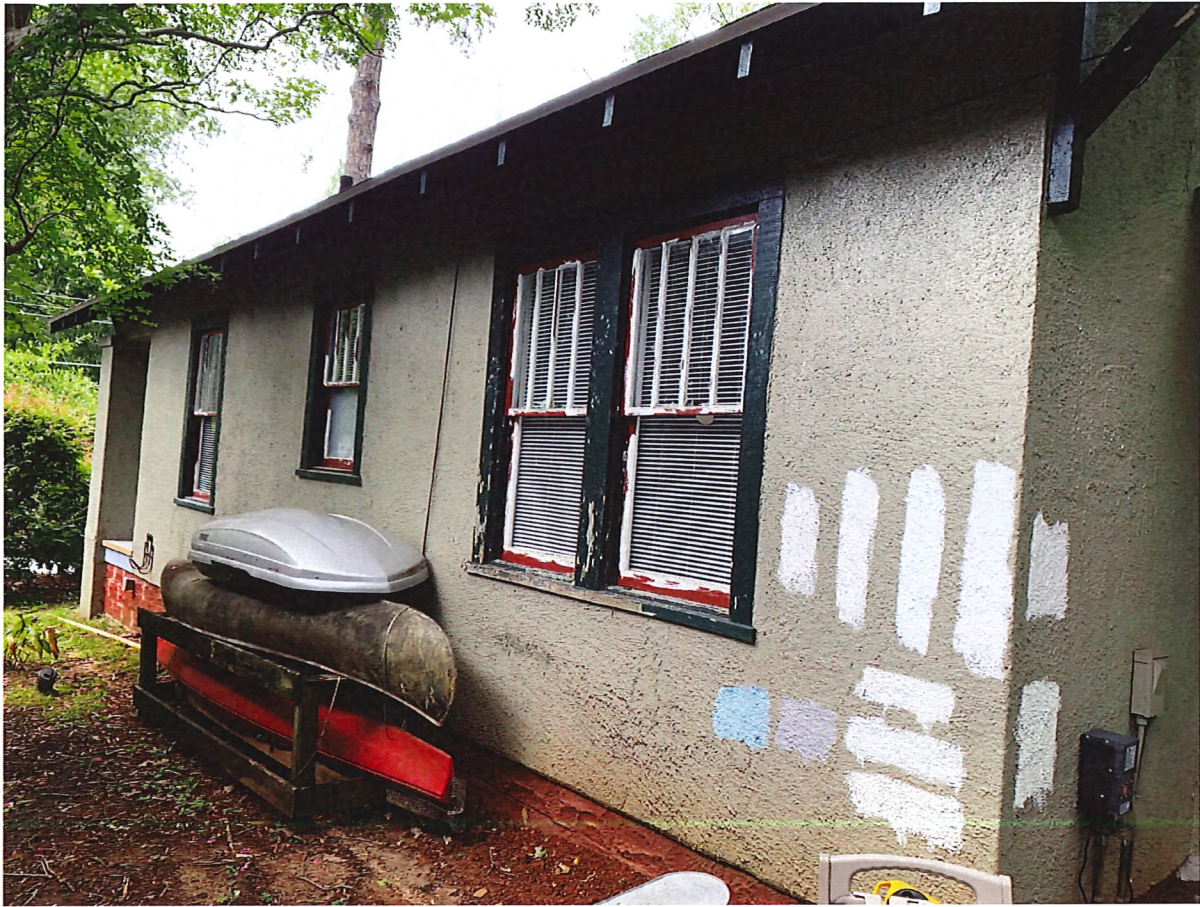
Right Side (Northeast)