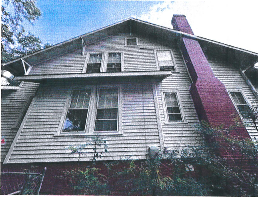
Men's Home right side facing