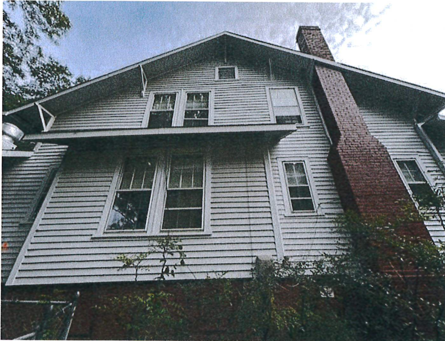
Men's Home left side facing