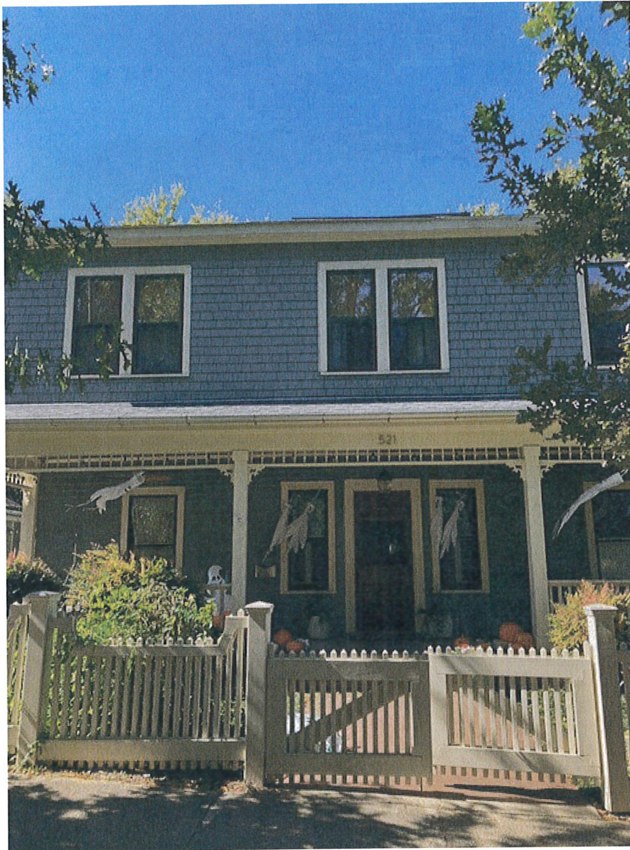
Oakwood Homes Similar in Color