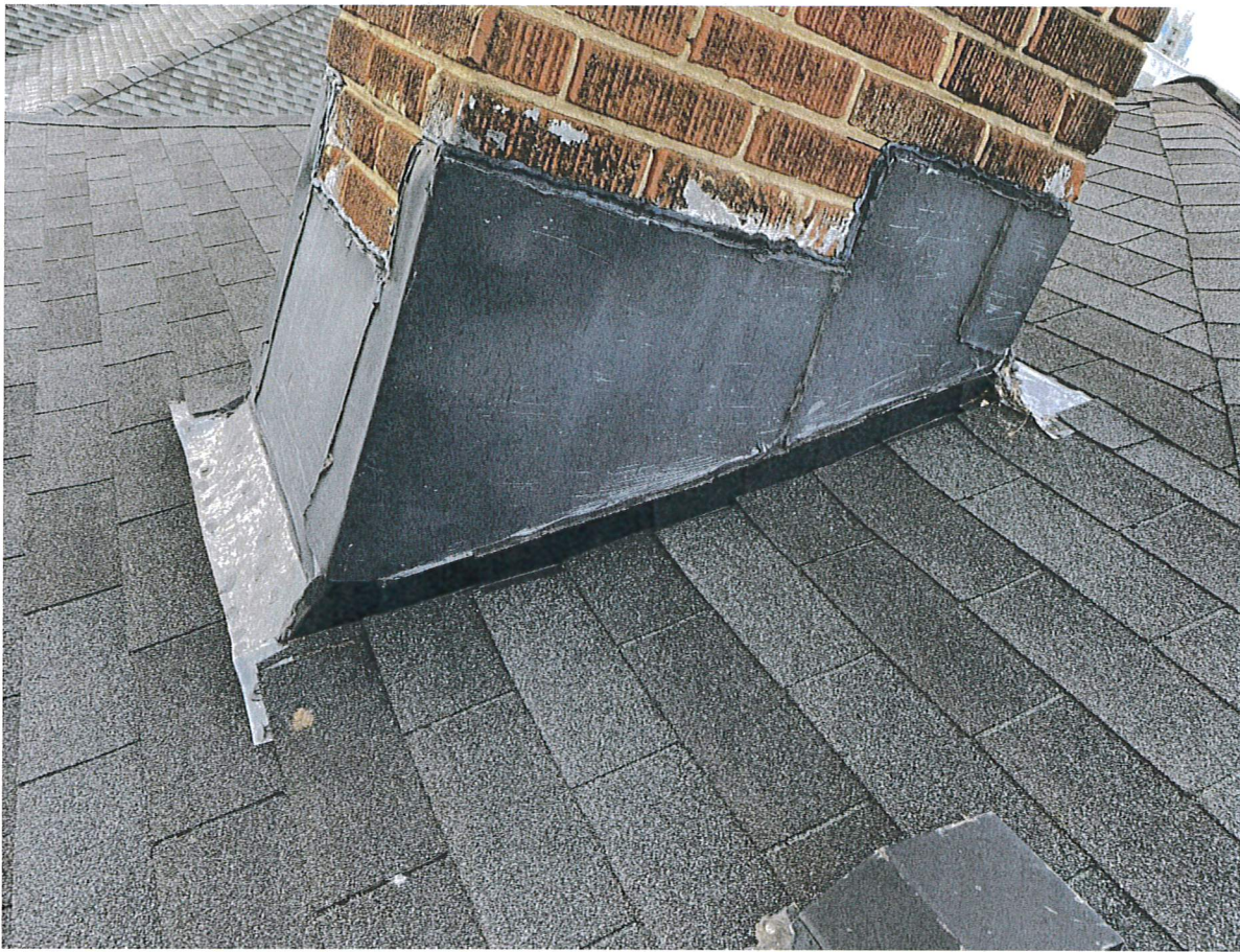
Chimney (right side): flashing is installed incorrectly and is prone to water damage