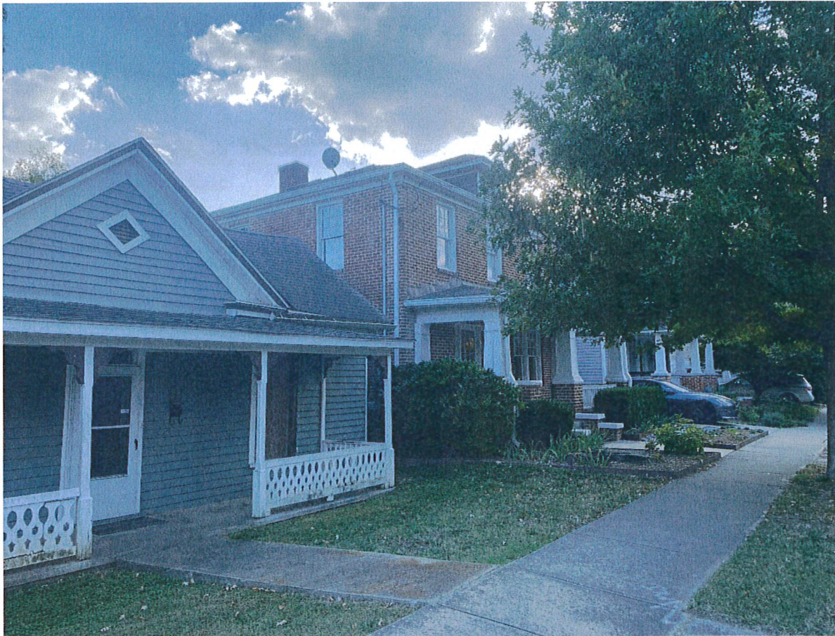
Left side of house from street: chimney not a prominent feature of the house. You can also see the satellite dish in this photo.