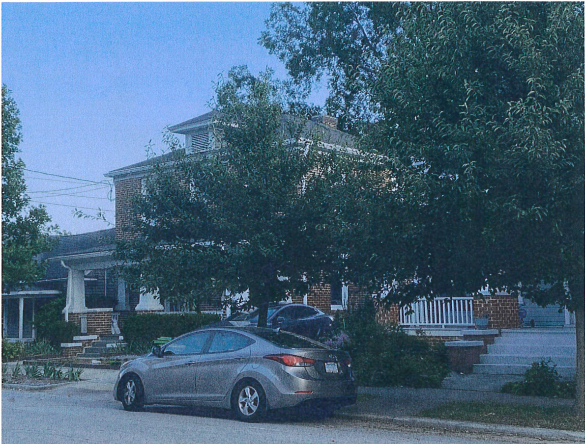
Further to the right side of house from street: chimney is barely visible and not a prominent feature