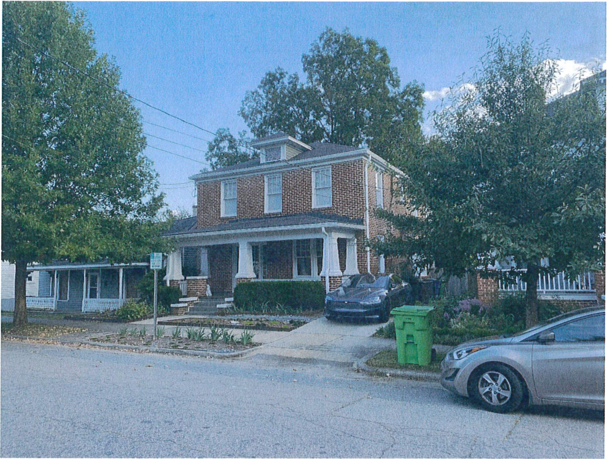
Right side of house from street: chimney is not visible