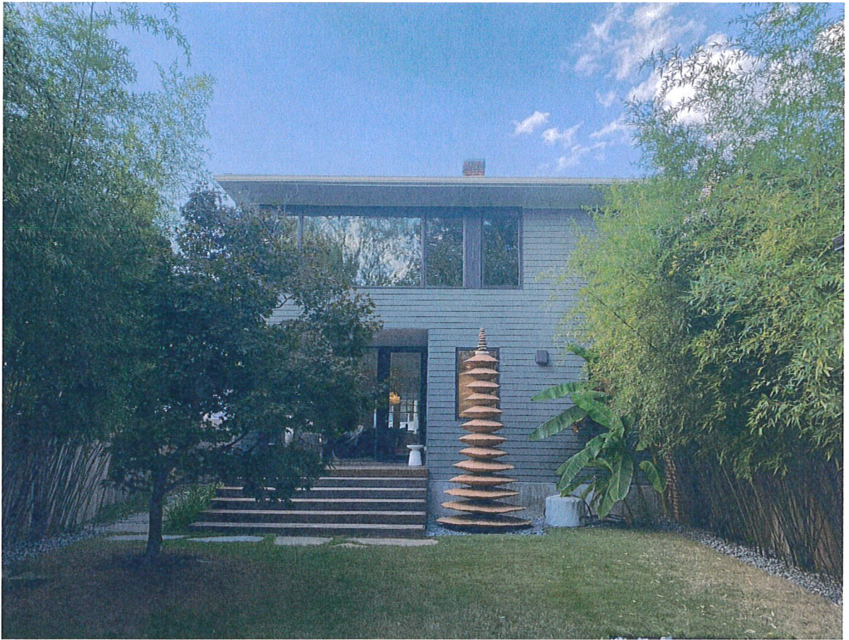
Back of house: chimney only visible from very back of yard at the fence