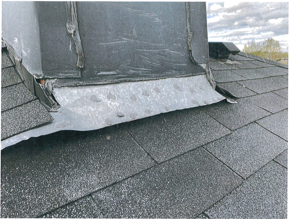
Chimney (back side): flashing has large gaps and is prone to water damage