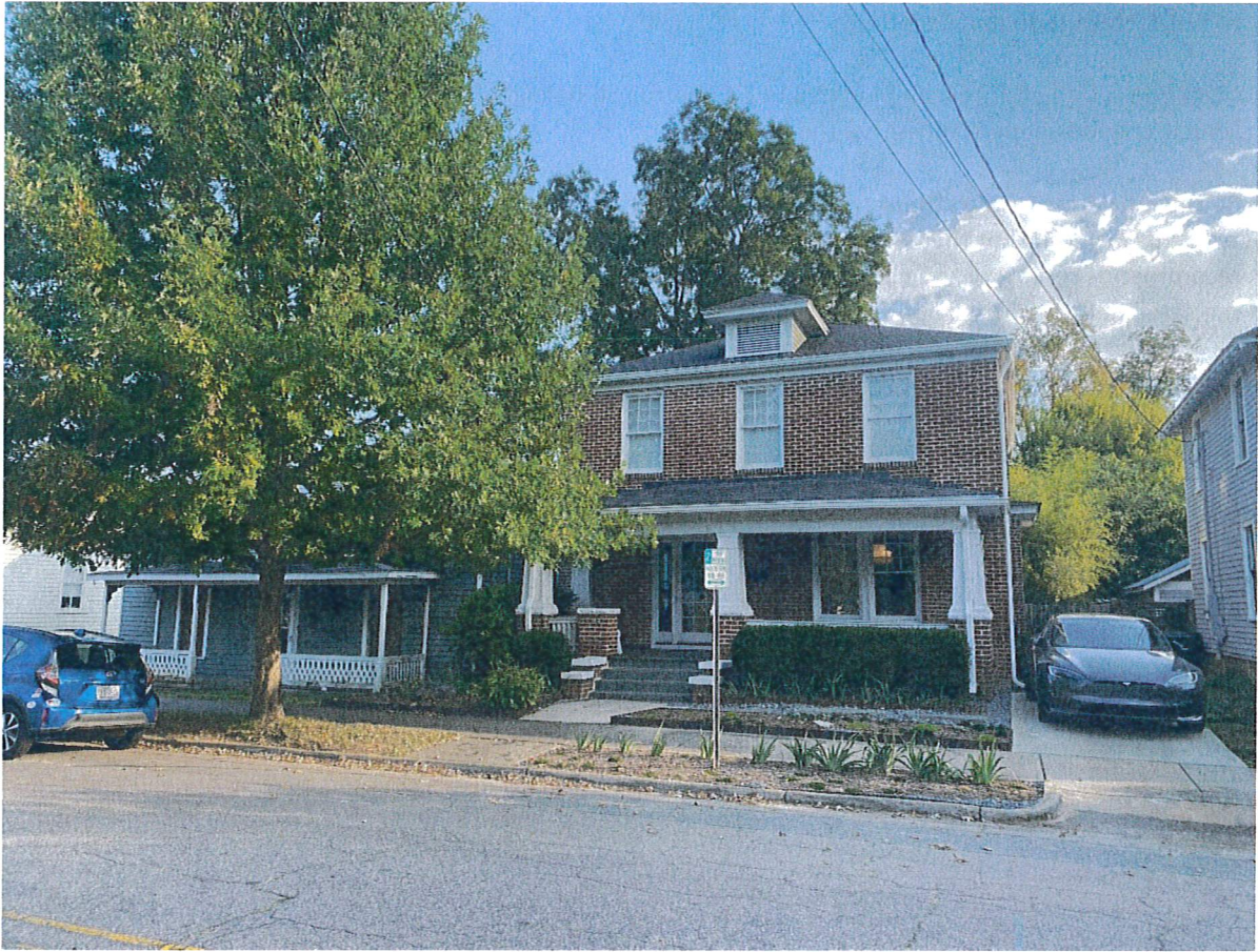
Front of house from street: chimney is not visible