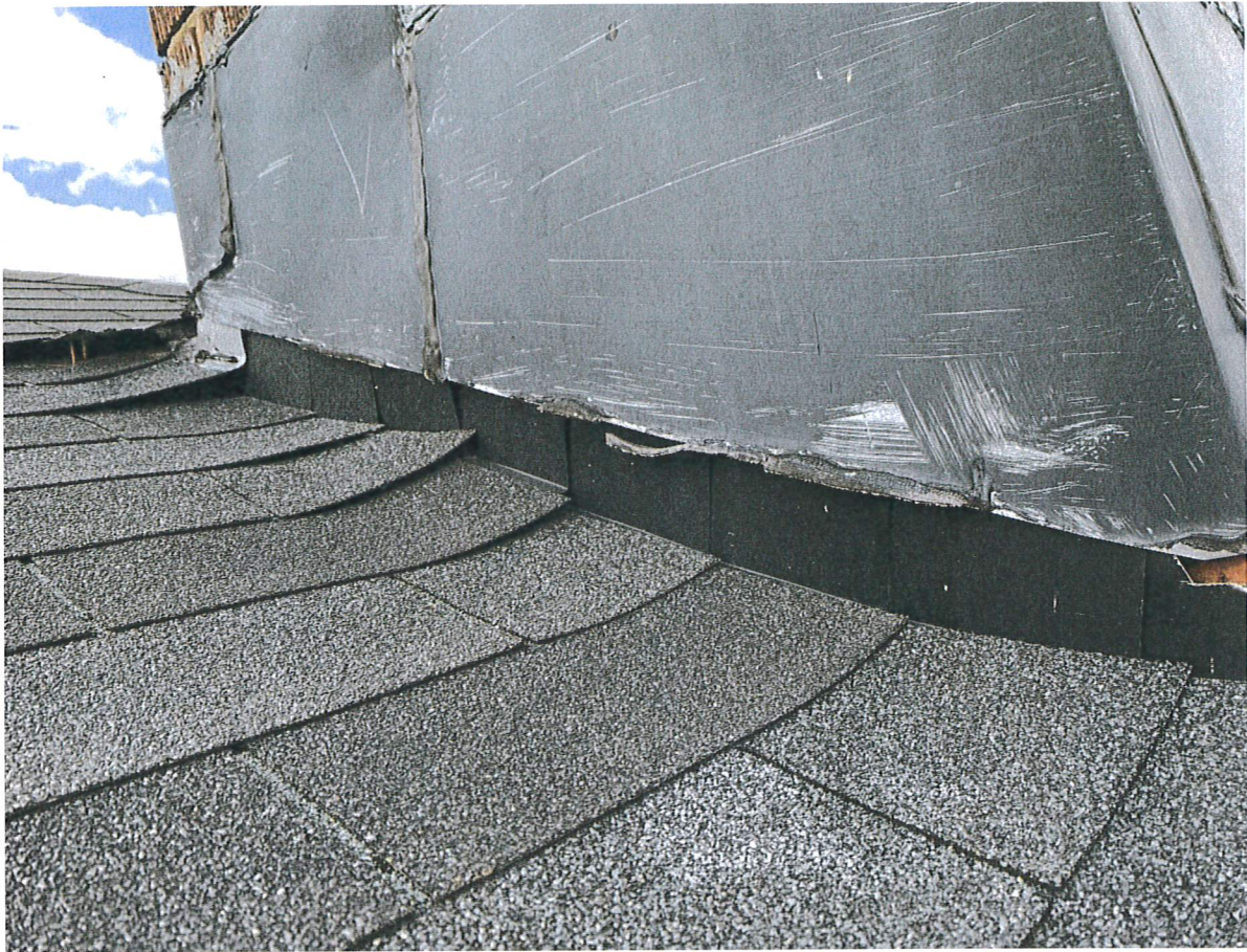
Chimney (left side): flashing/ roof tiles are is installed incorrectly and are prone to leaks/ water damage