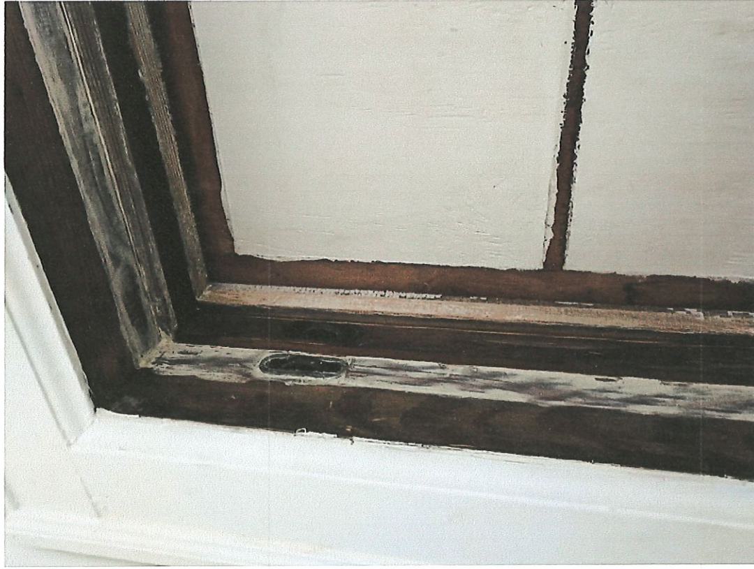
Existing window jamb uncovered Left side pulleys intact