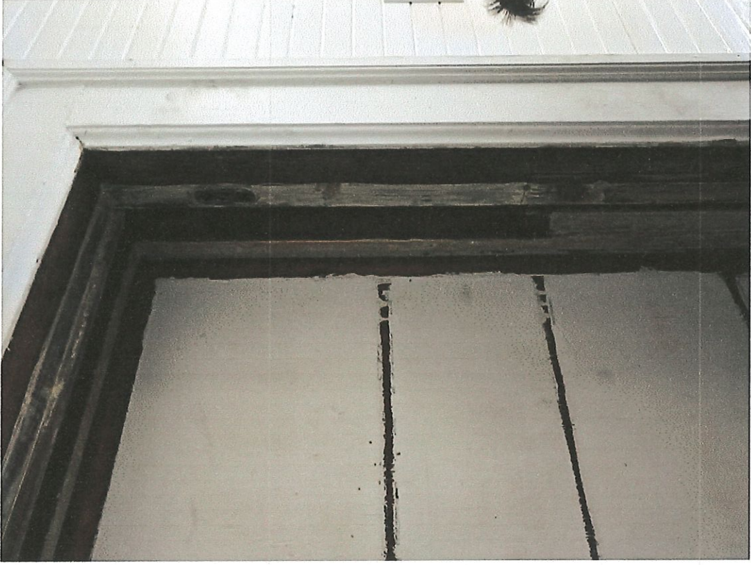
Existing window jamb uncovered Right side pulleys intact