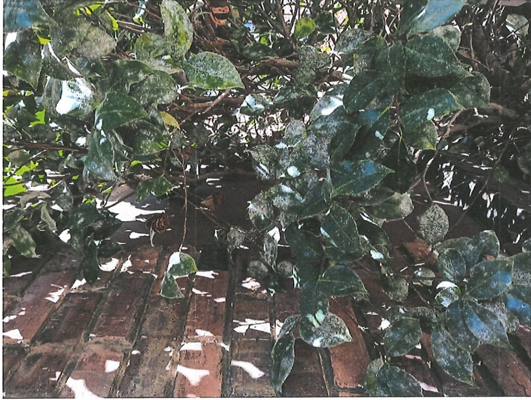
Existing window frame covered by plywood and shrub on exterior (to be removed)