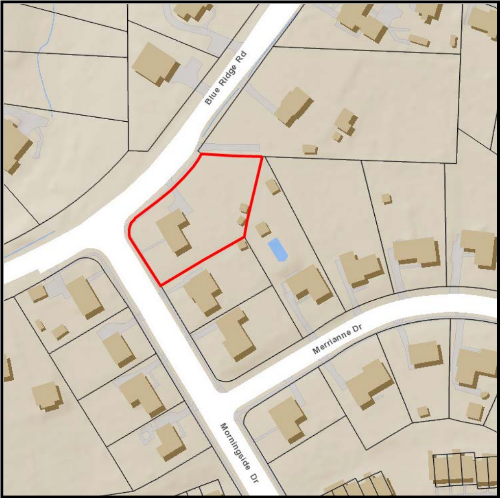
S-27-16 Location Map