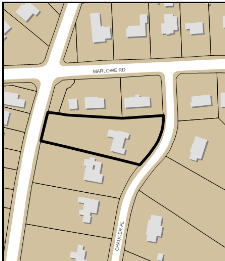
S-29-16 Location Map