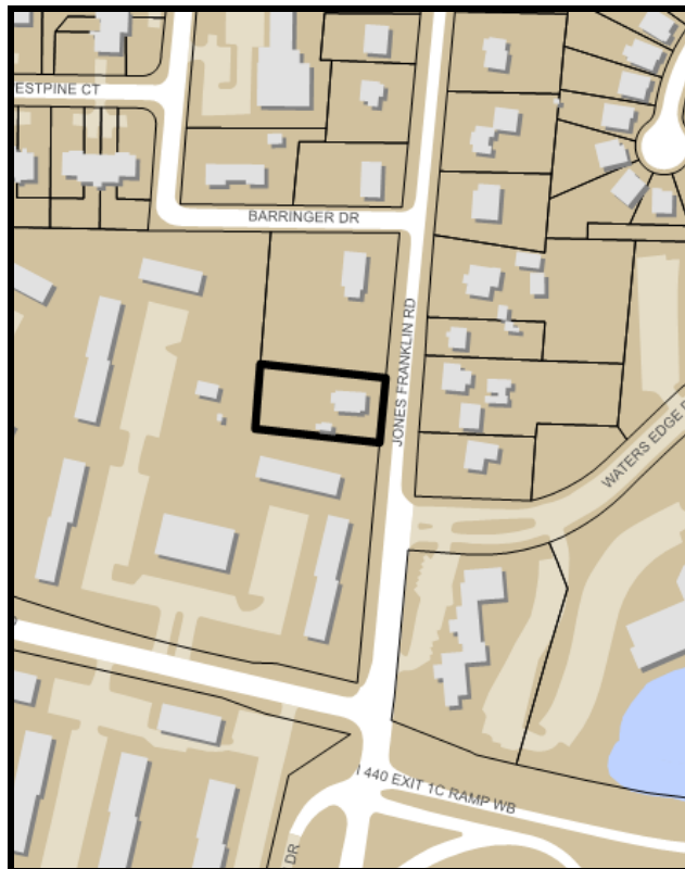
S-44-14 Location Map