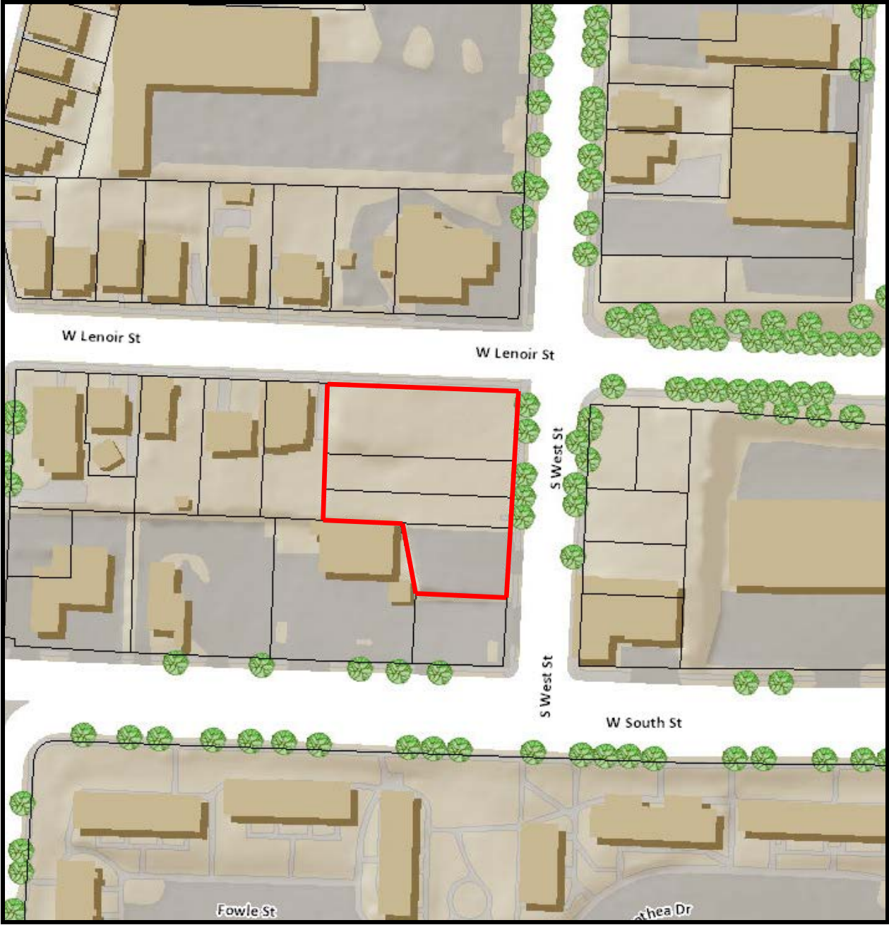
Location Map – Proposed Preliminary Subdivision S-57-15