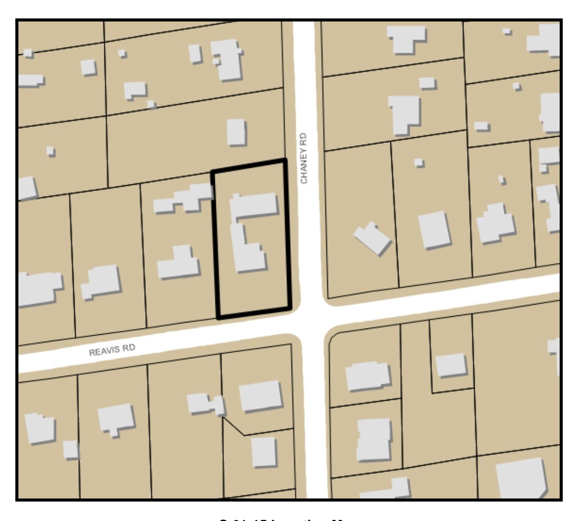
S-61-15 Location Map