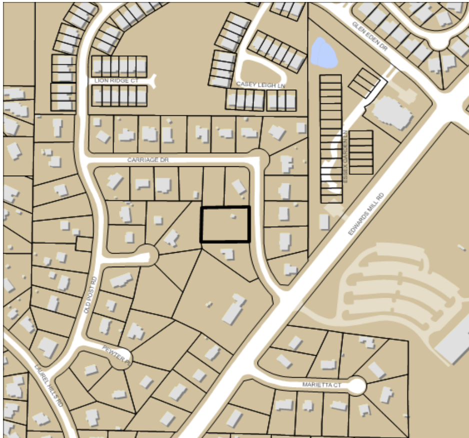
Carriage Hills Lots 7 & 8 Subdivision Location Map S-71-16