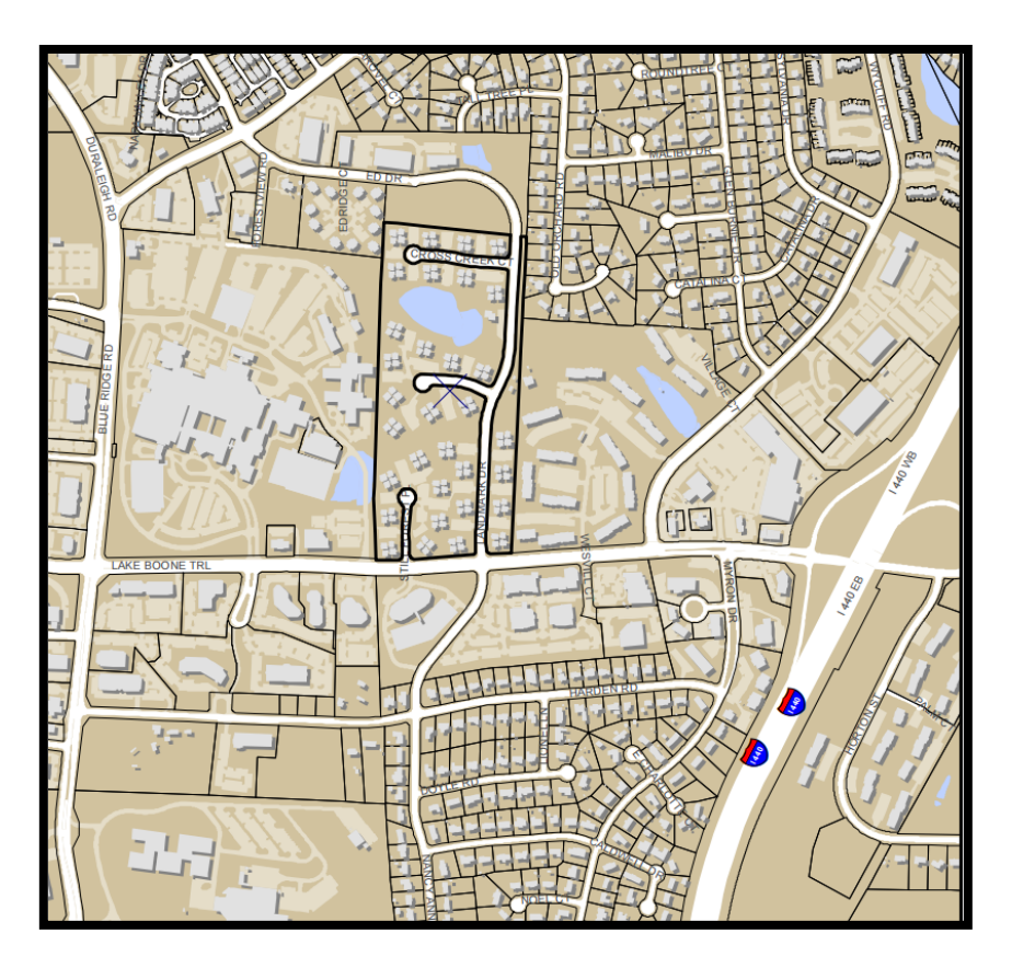
SR-13-15 - Location Map