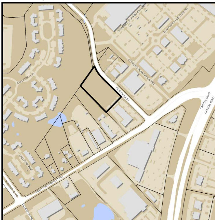
SR-16-16 Location Map