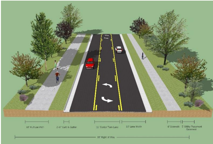
Typical Section Alternative 1