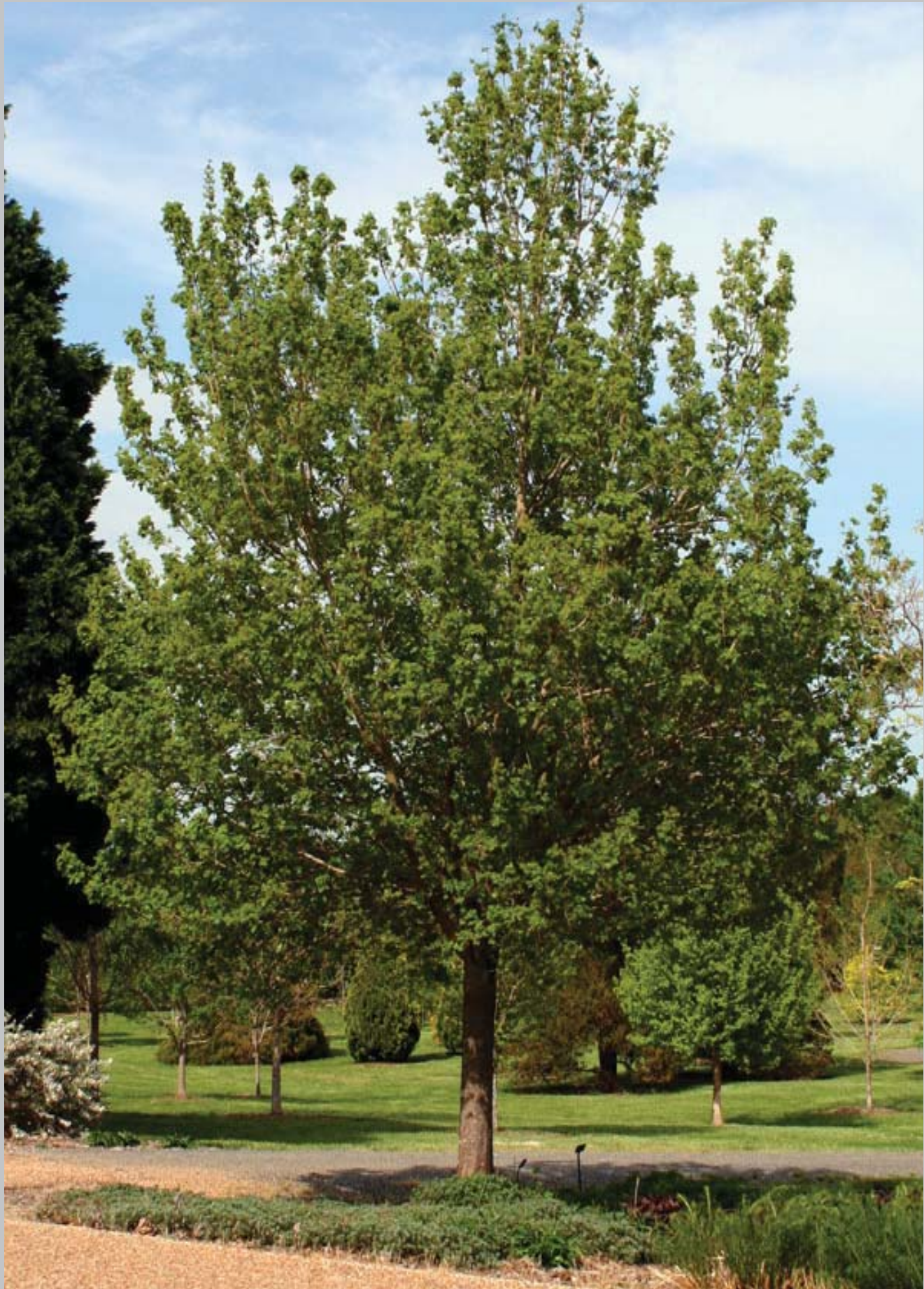
QUEEN ELIZABETH MAPLE ACER CAMPESTRE 'EVELYN' HEIGHT: 35' ; SPREAD: 30'