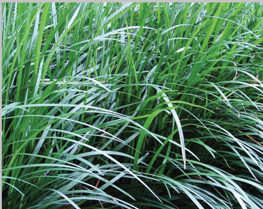
MONDO GRASS OPHIPOGON JAPONICUS HEIGHT: 6" - 3'; SPREAD: 1'