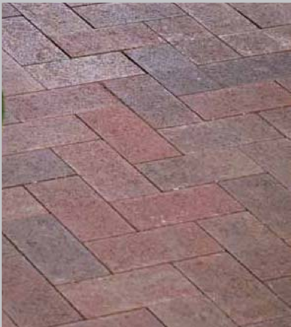
4"X8" HOLLAND STONE BY BELGARD/OLDCASTLE/ADAMS COLOR: CITY BLEND