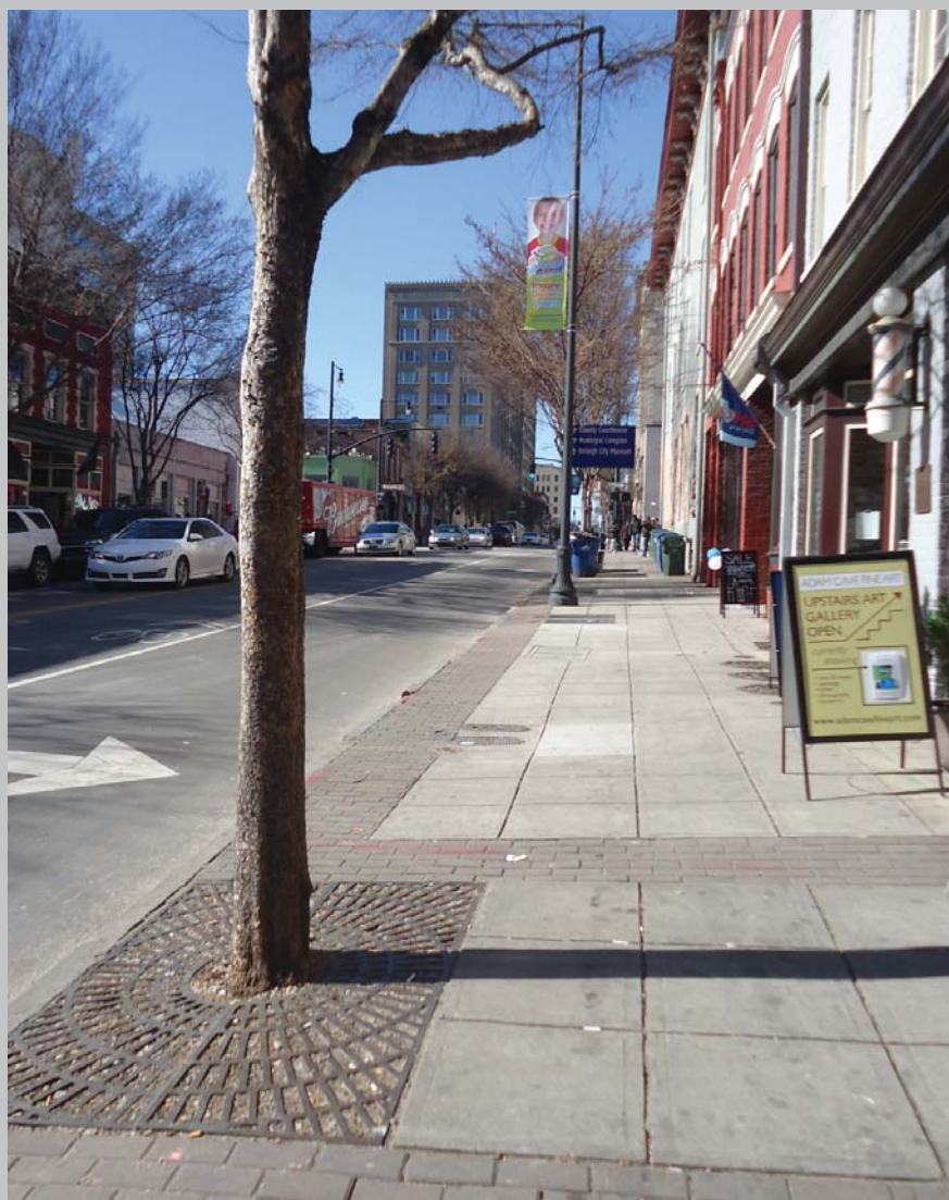
48"x72" CAST IRON TREE GRATE BY NEENAH FOUNDRY, BOULEVARD COLLECTION R-8811