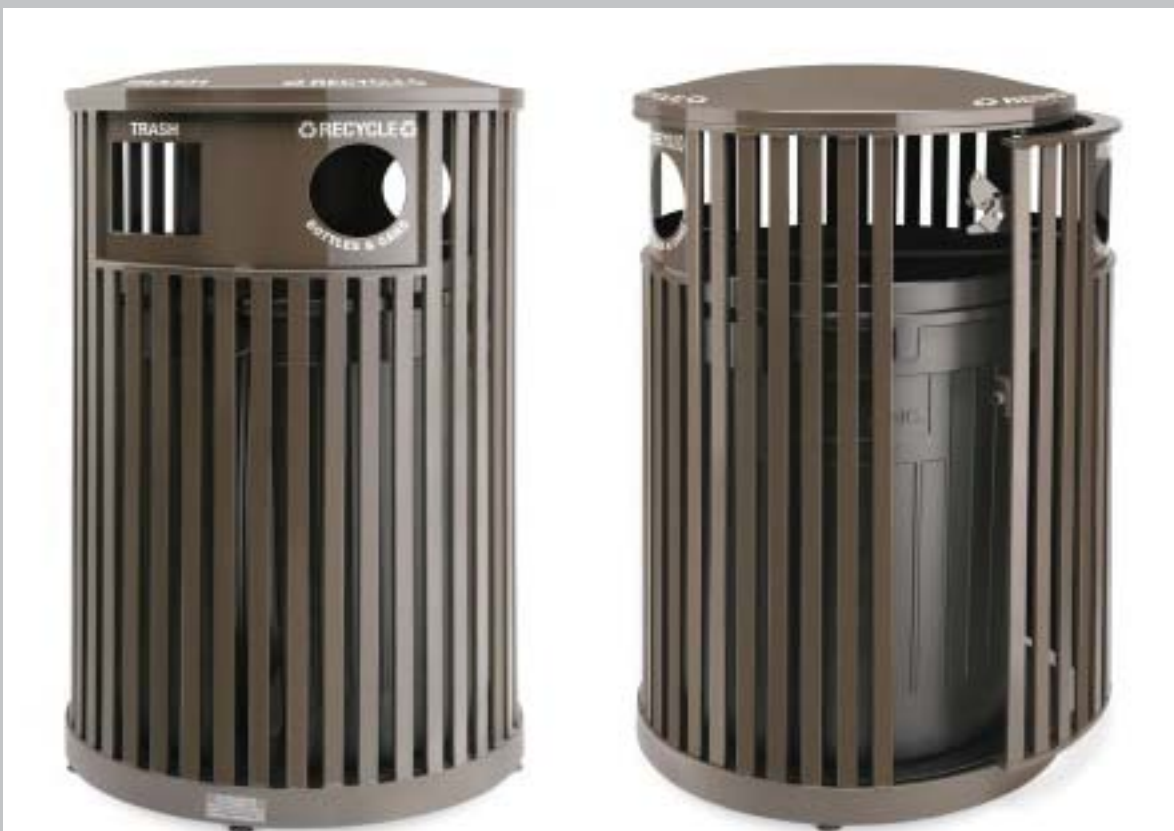
TRASH / RECYCLING BY VICTOR STANLEY, INC. VICTOR STANLEY RB-36 (STEEL SITES RB SERIES)