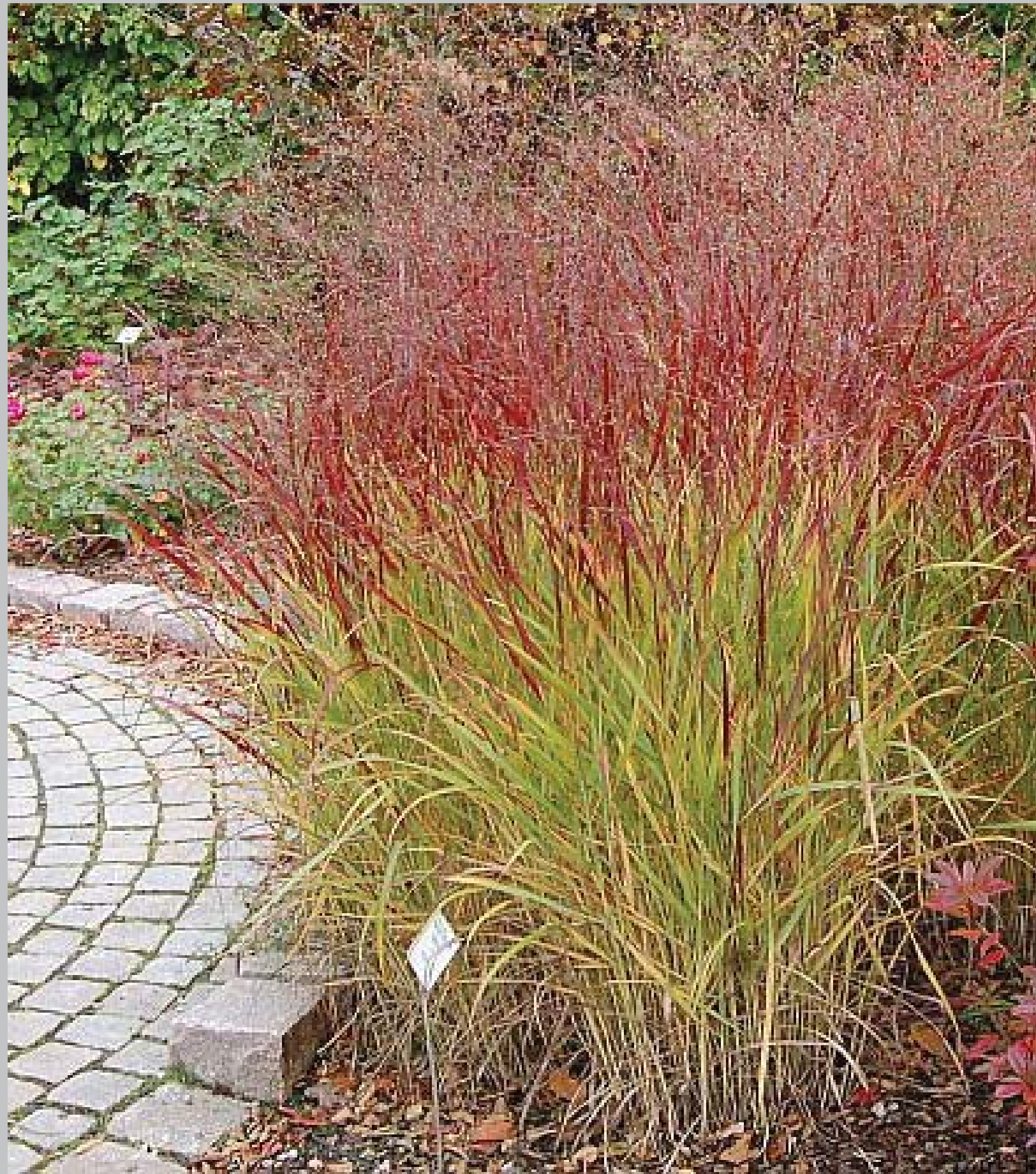
BURGUNDY SWITCH GRASS PANICUM VIRGATUM 'SHENENDOAH' HEIGHT: 4' SPREAD: 2' - 3'