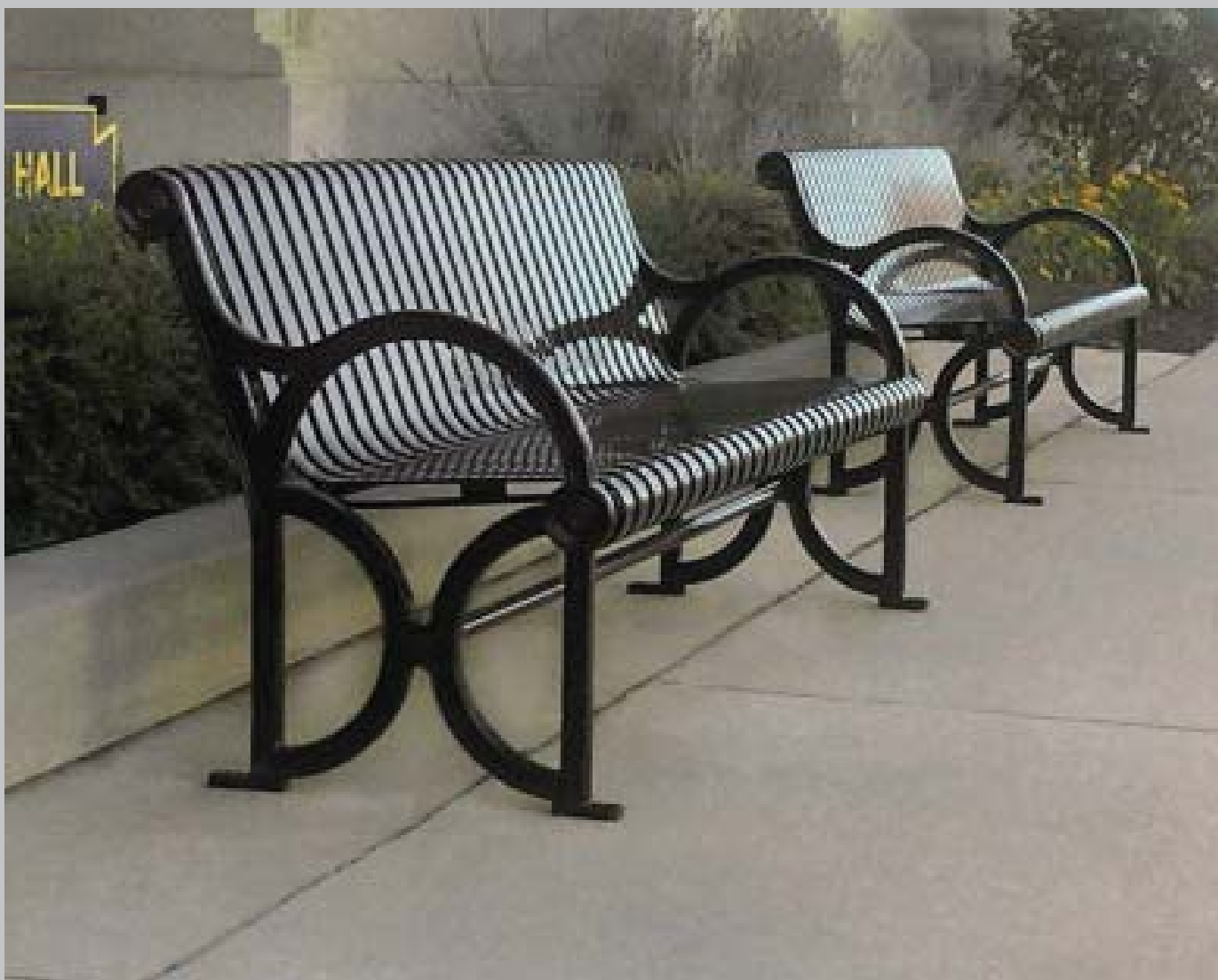
STEEL BENCH AT BUS STOP BY VICTOR STANLEY, INC. VICTOR STANLEY RB-28 (STEEL SITES) /CR-18 (CITY SITES)