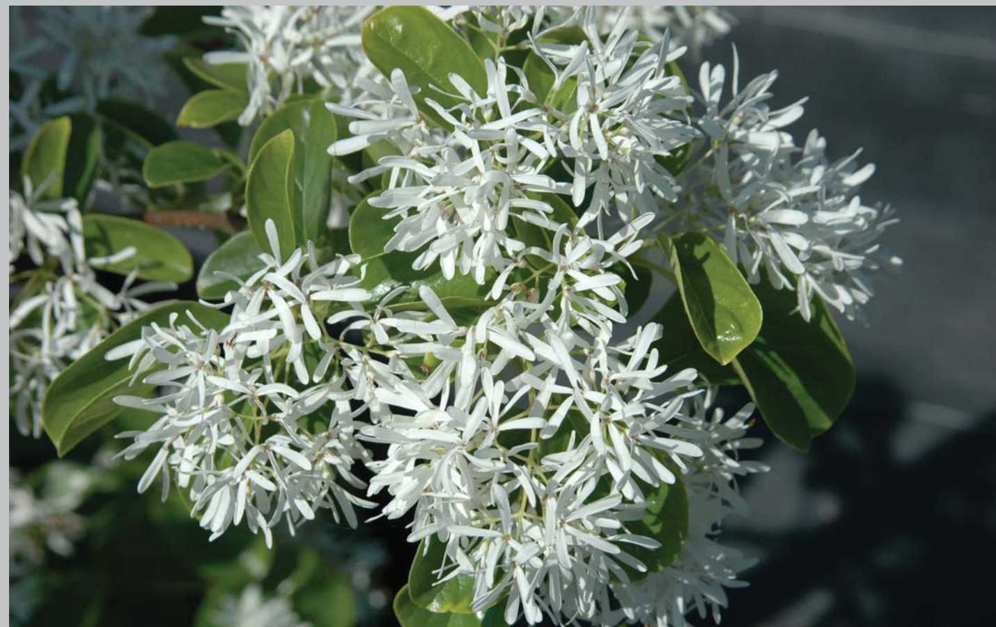
CHINESE FRINGE TREE CHIONANTHUS RETUSUS HEIGHT: 15' - 20' ; SPREAD: 20' - 25'