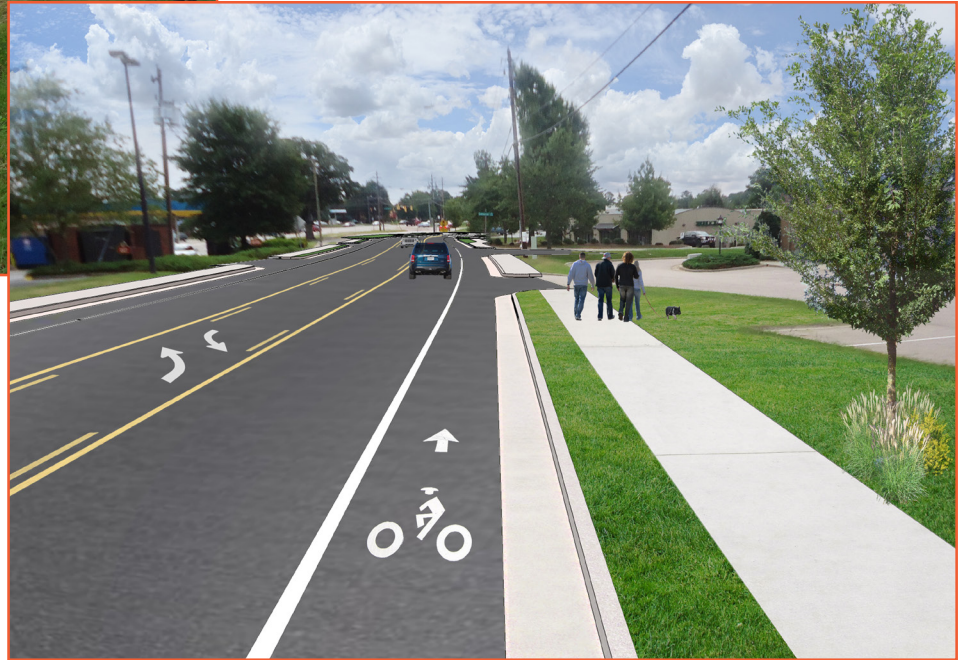
▶ Right: Proposed rendering of Pleasant Valley Road looking East