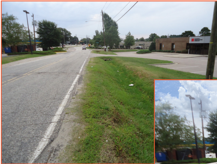
◀ Left: Existing Pleasant Valley Road looking East