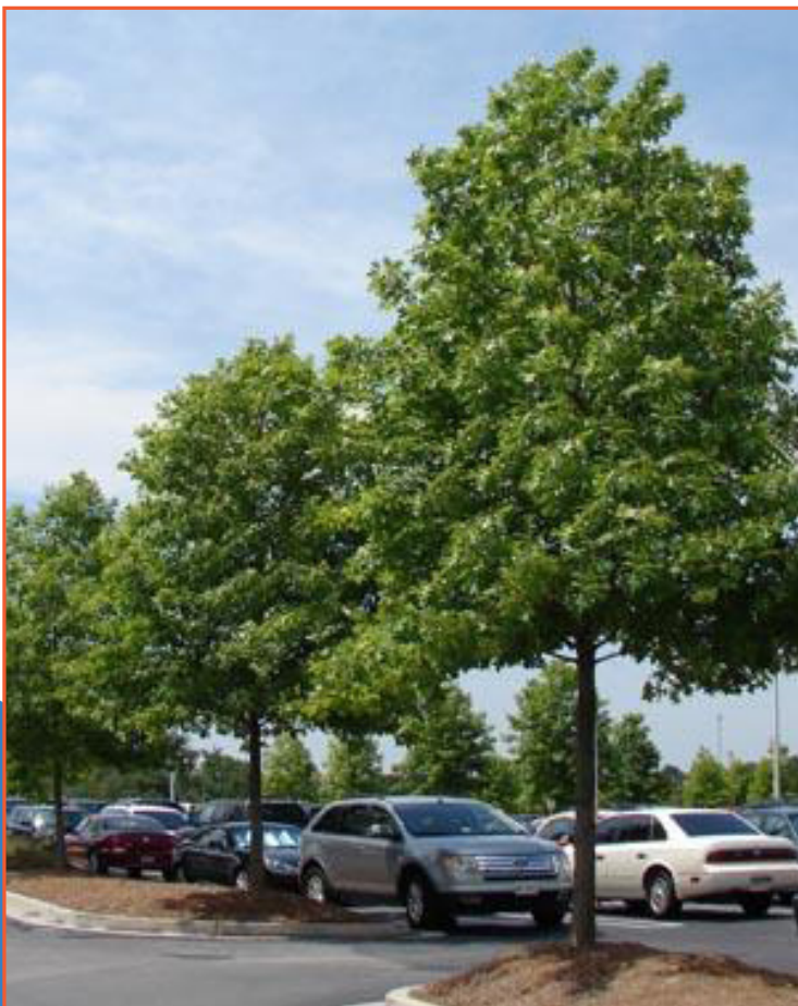
◀ Improvements along Pleasant Valley Road also involves landscaping enhancements including planting street trees and selecting plants that foster design cohesion and uniformity.