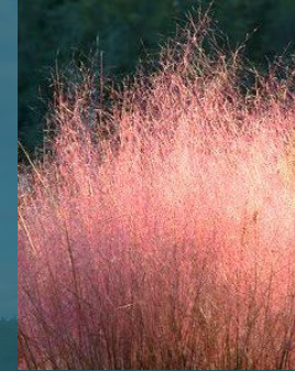
Pink Muhly Grass