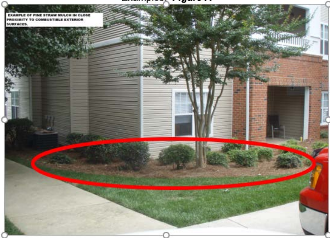
Examples Figure A