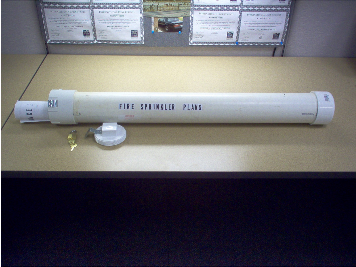
Record Document Storage Tube (Details FP-20)