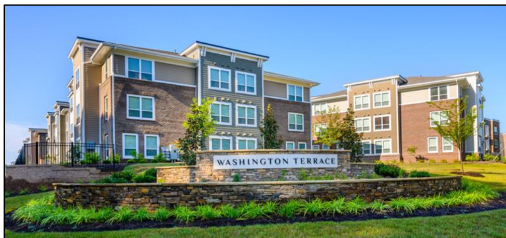
New apartments created in the NRSA.

The City's Affordable Housing Improvement Plan set a goal of increasing the pace and volume of affordable housing development, and the goal was addressed through City-sponsored creation and preservation of affordable housing units.