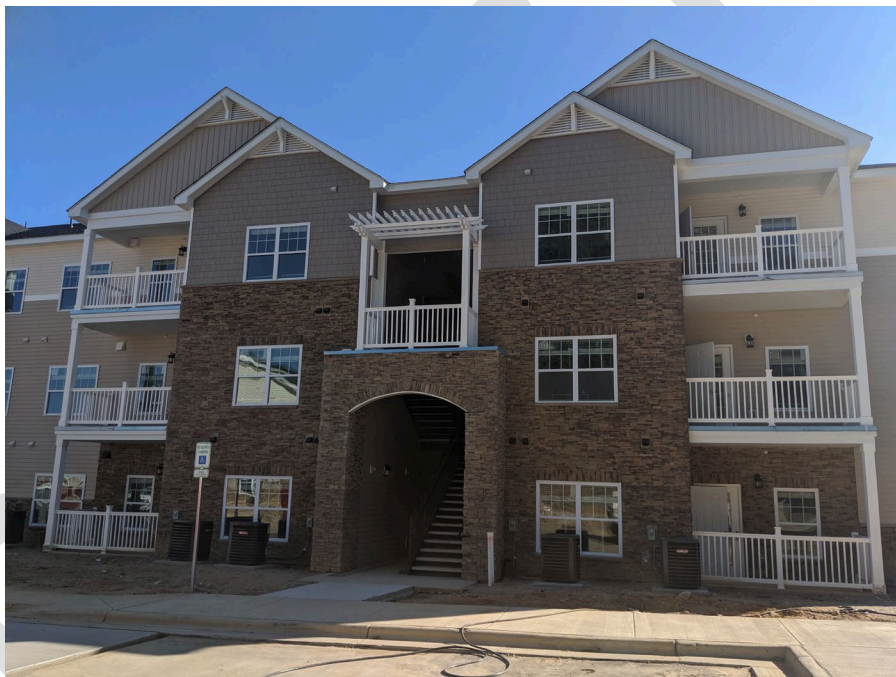
Sunnybrook Pointe Apartments

Affordable Apartments: Increasing the stock of rental apartments for low-and-moderate-income residents is an overwhelming need in the City of Raleigh. Using federal and local money, the City partners with other funders (such as Wake County and the NC Housing Finance Agency) and affordable housing developers to build rentals. Most of the affordable apartment loans provided by the City are a portion of the entire investment package to create new affordable apartments, with low-income housing tax credits and private loans being the other major sources of funds.