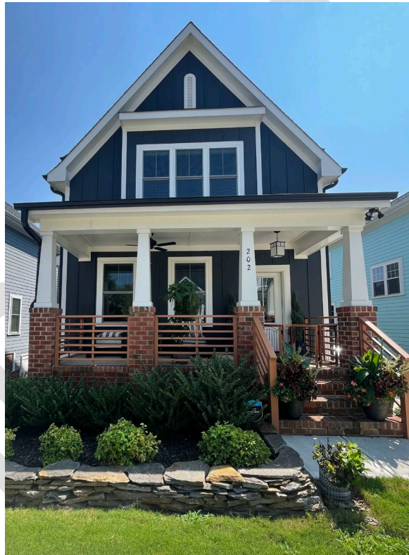
Housing in East College Park

The City's Affordable Housing Improvement Plan set a goal of increasing the pace and volume of affordable housing development. This goal was addressed through City-sponsored creation and preservation of affordable housing units as well as down payment assistance to eligible homebuyers.