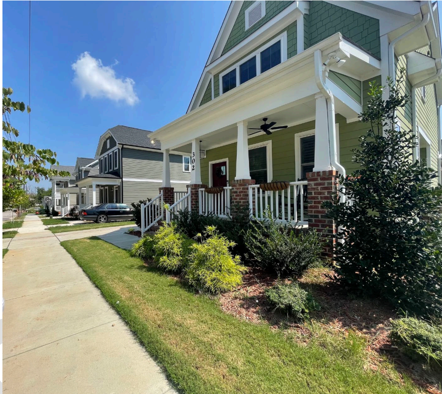
Hill Street in East College Park

City of Raleigh: The City of Raleigh has prioritized investing in affordable housing and community development programs. In the past year, federal dollars were leveraged with local funding.