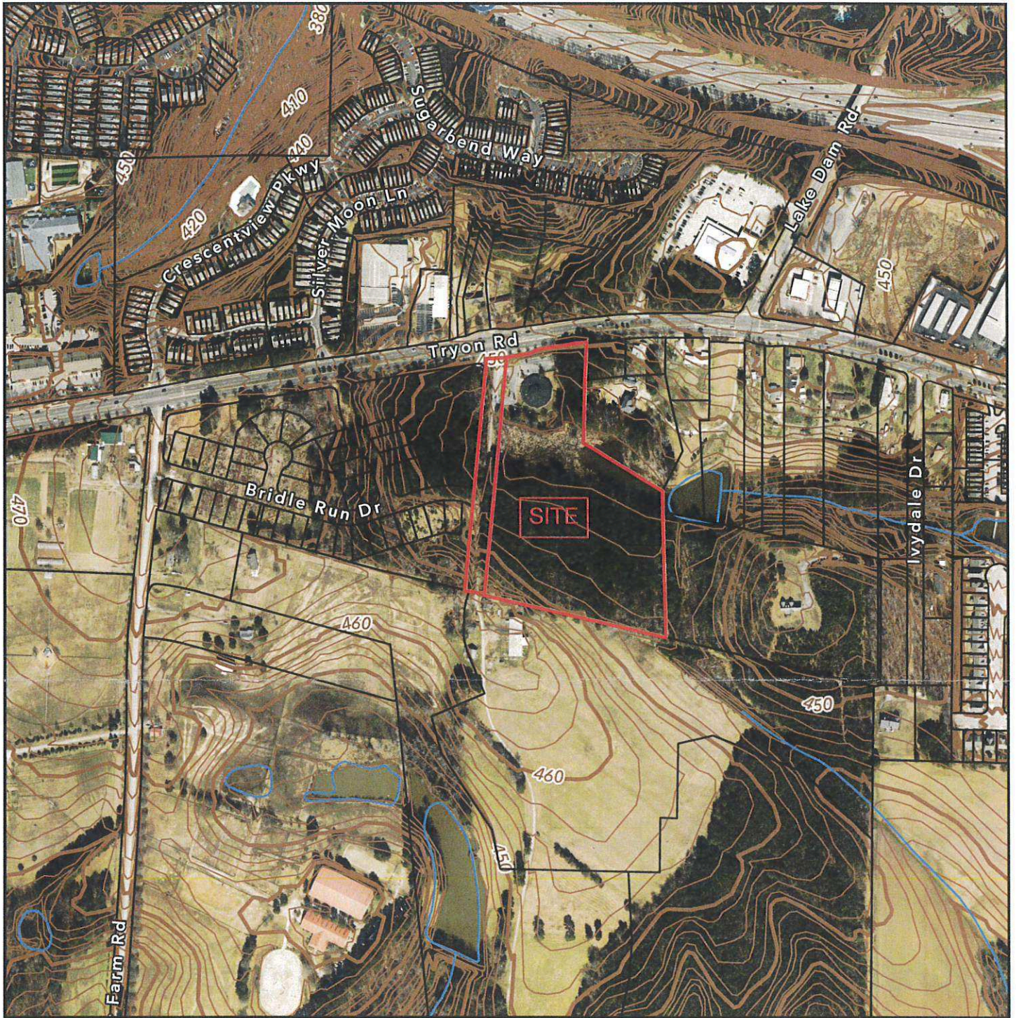
4325 Tryon Road Vicinity Map