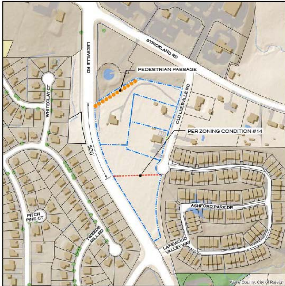
Z-6-16- EXHIBIT A (07/01/2016)