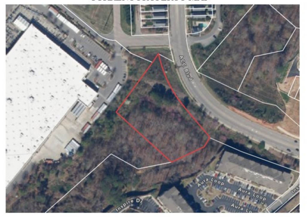
CURRENT ZONING MAP