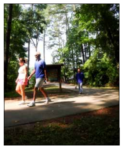
Greenway Volunteers promote courtesy and safety while performing their daily routines on the paths.

Volunteers will not only perform their daily routine, but will also help monitor activity on the Greenways and report unsafe conditions.